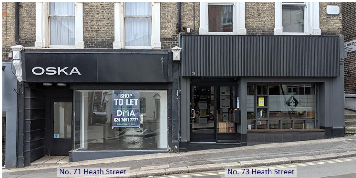
The current existing shopfront

The proposed works are illustrated on the accompanying drawings.