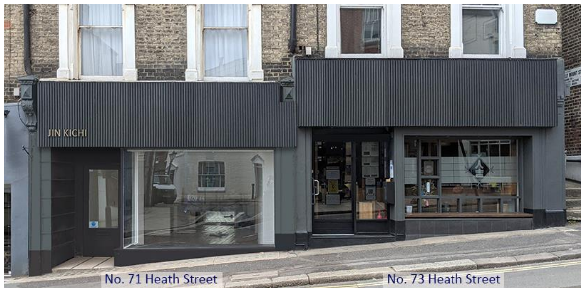
The proposed shopfront