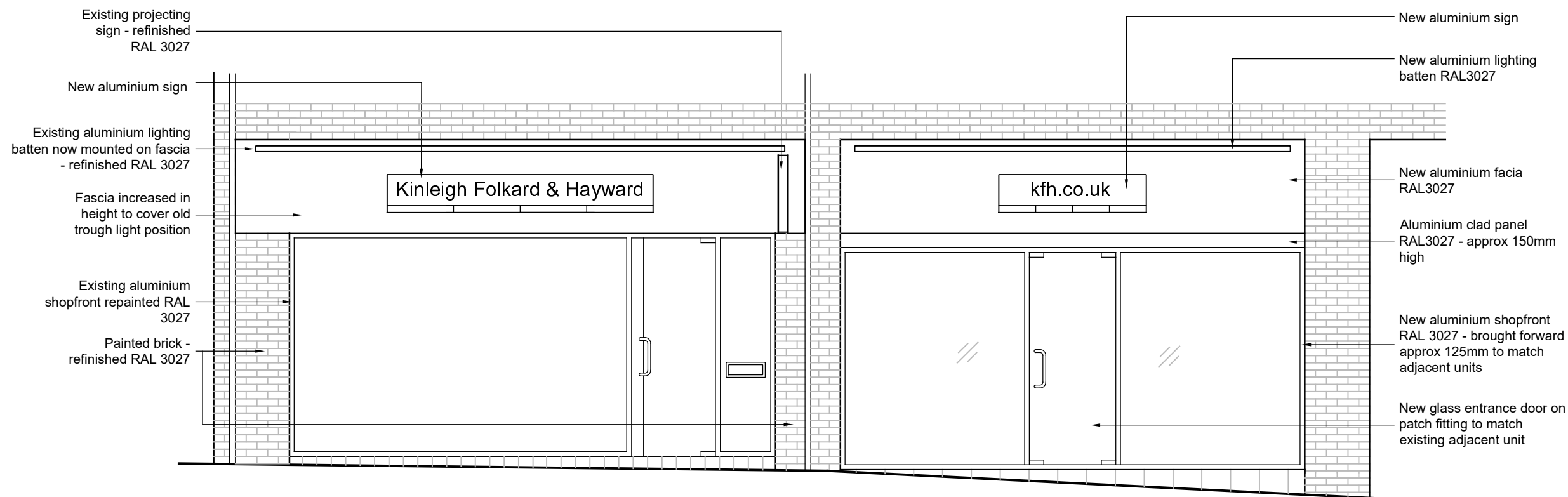
02 Proposed Elevation 1:50