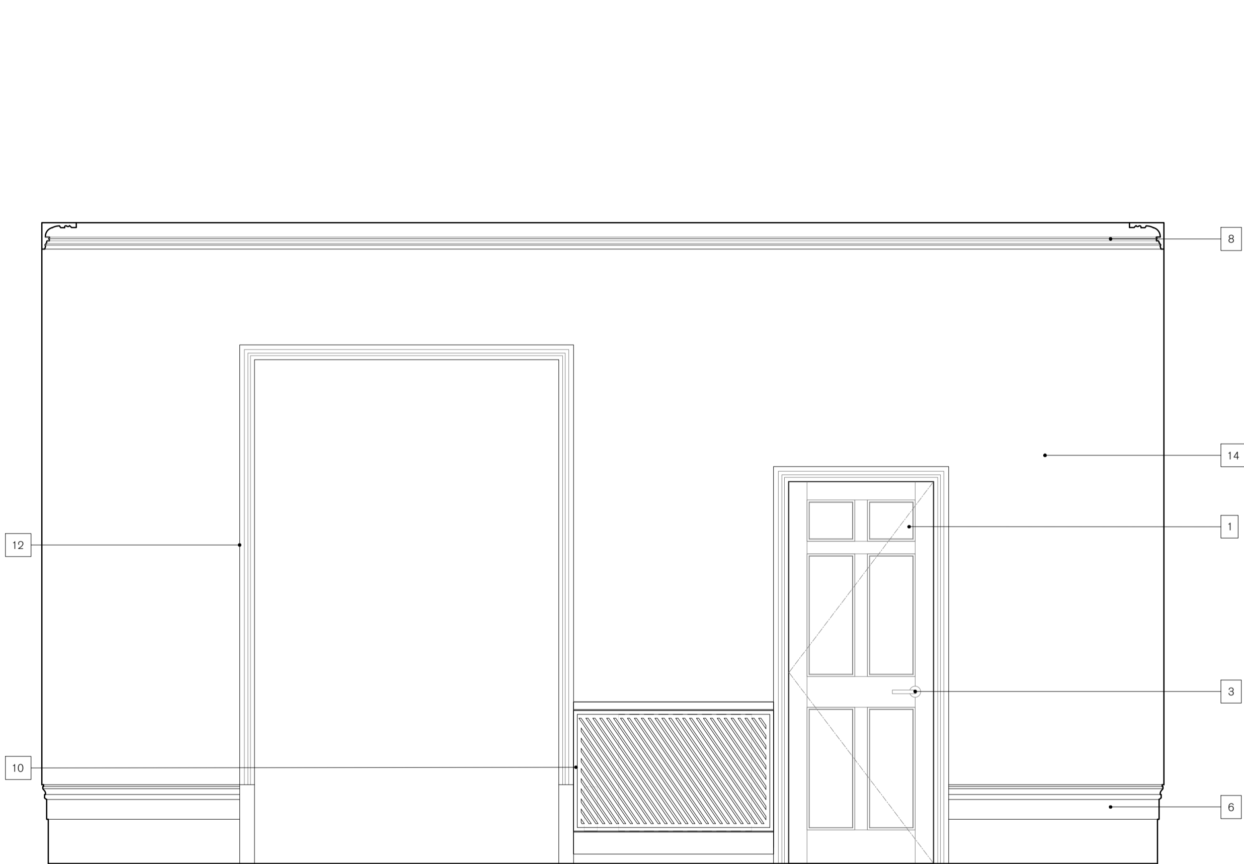
ELEVATION A 1:20