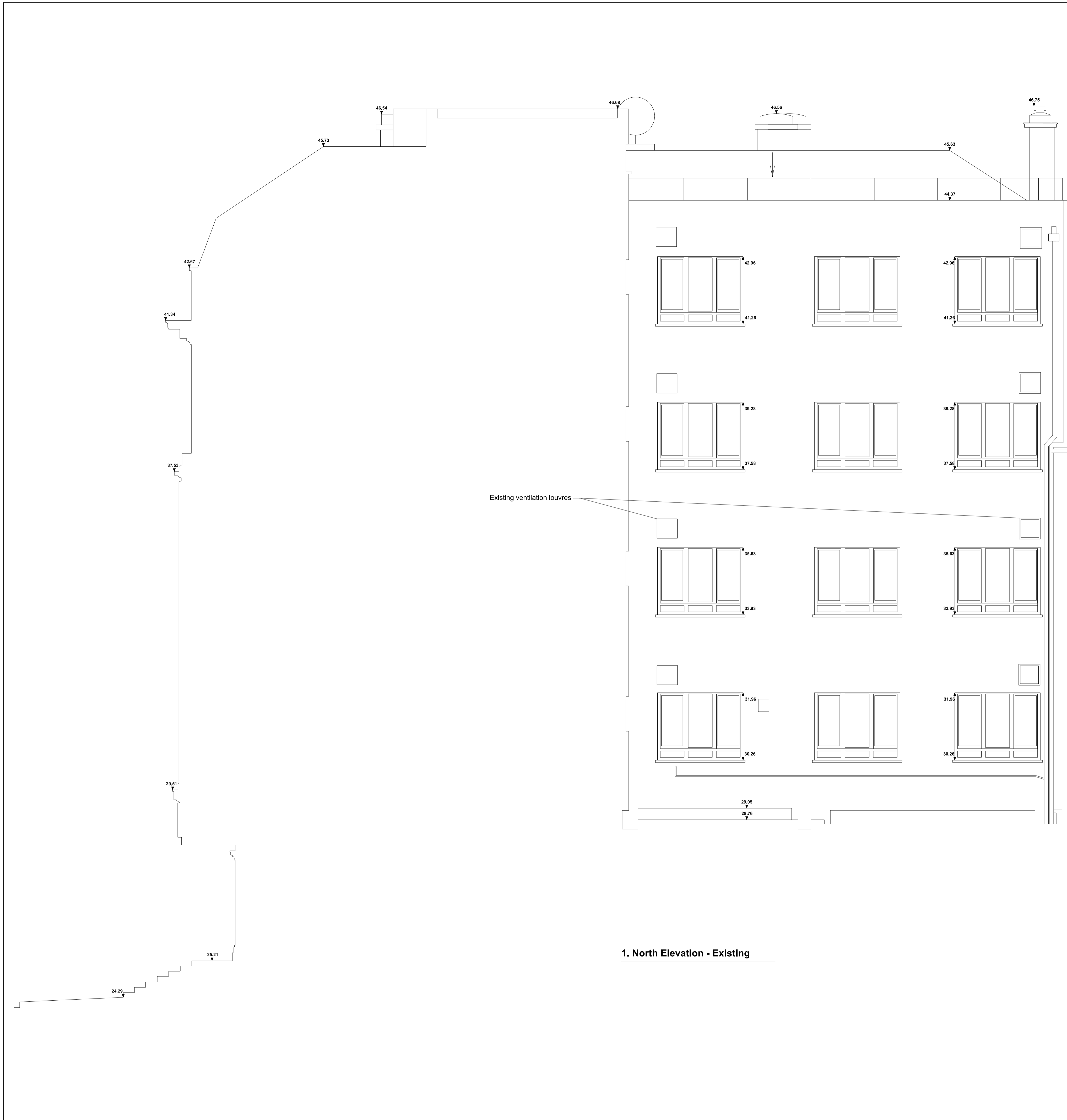
1. North Elevation - Existing