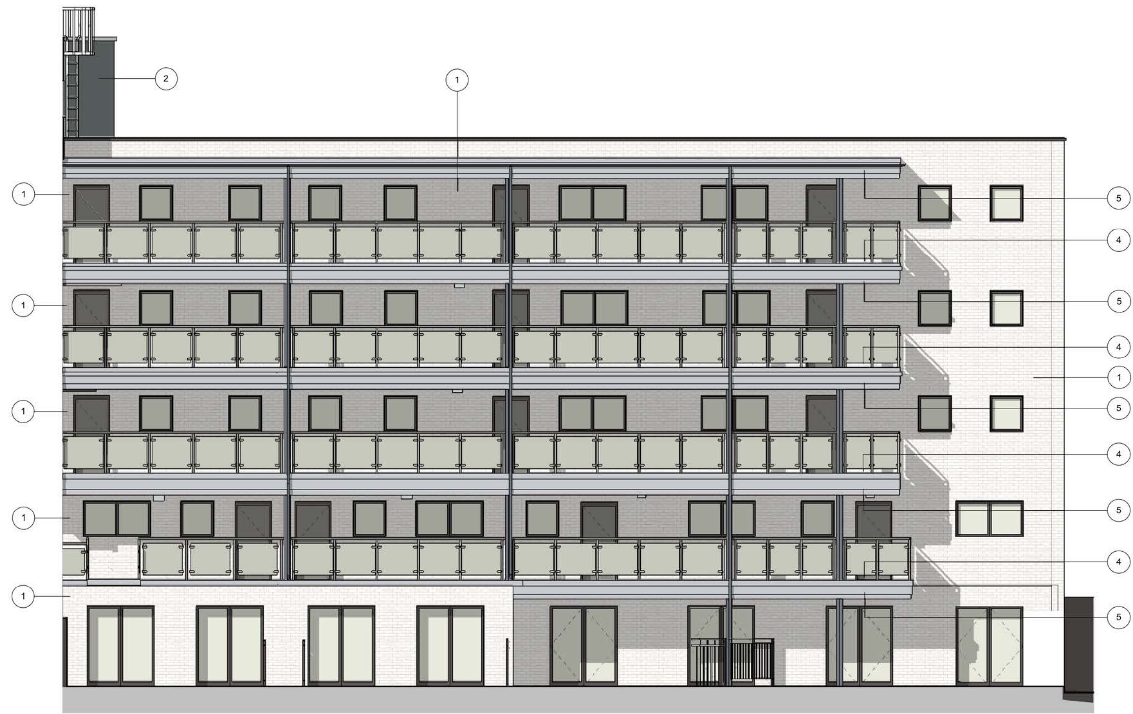
1 | North West Elevation Proposed 1 : 100