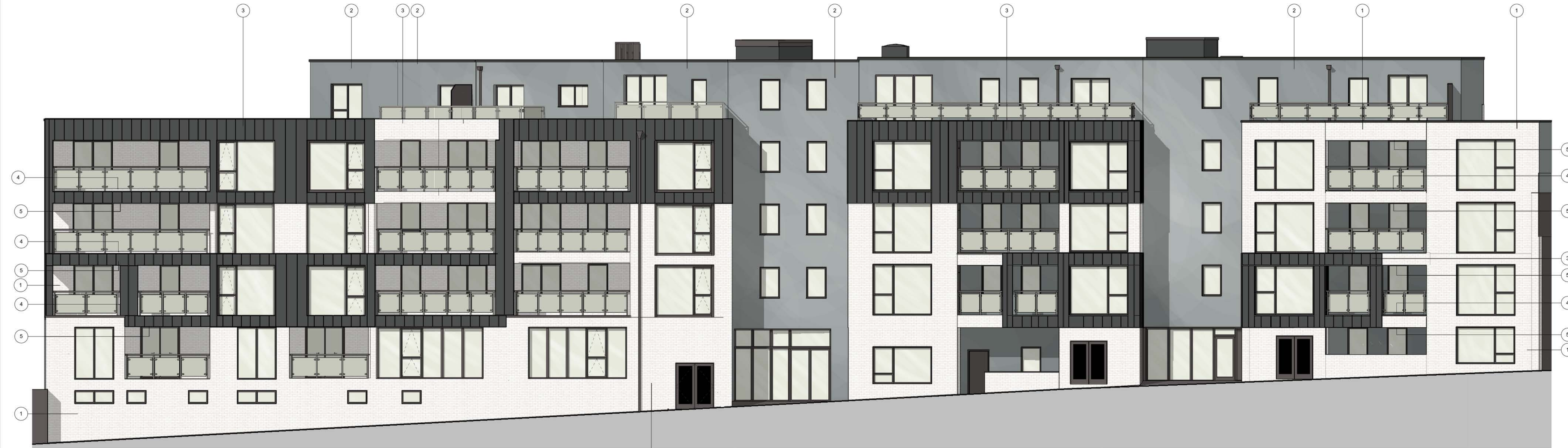
3 | South Elevation Proposed 1 : 100

/ 10/12/21 First Issue for Planning VK SW Rev Date Description Dwn Ckd