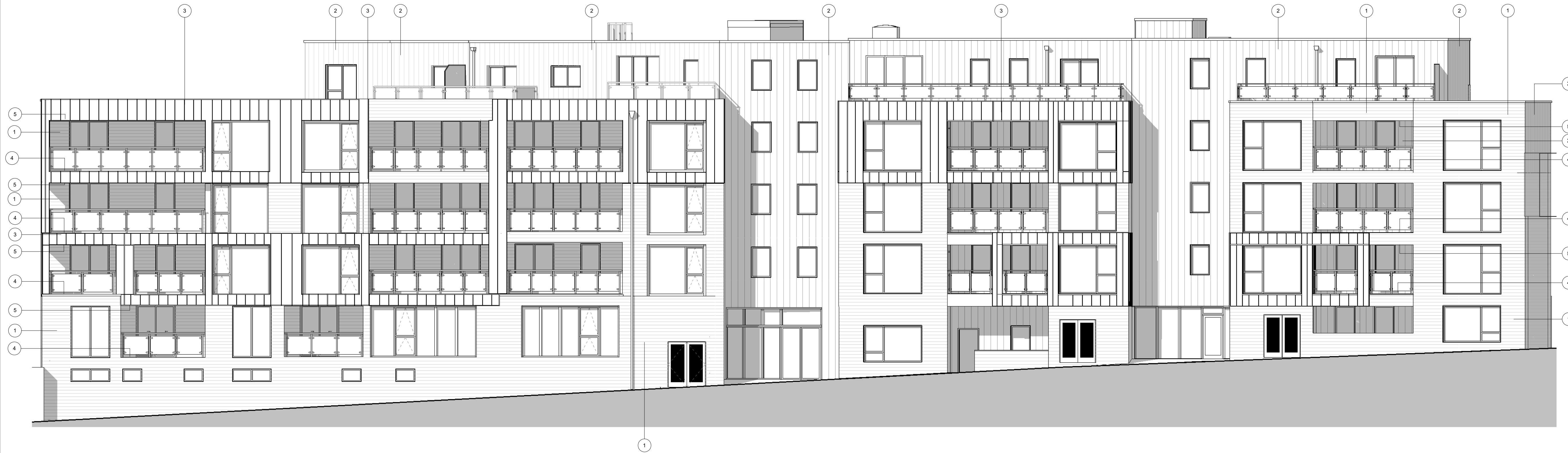
3 South Elevation Existing 1 : 100

/ 10/12/21 First Issue for Planning VK SW Rev Date Description Dwn Ckd