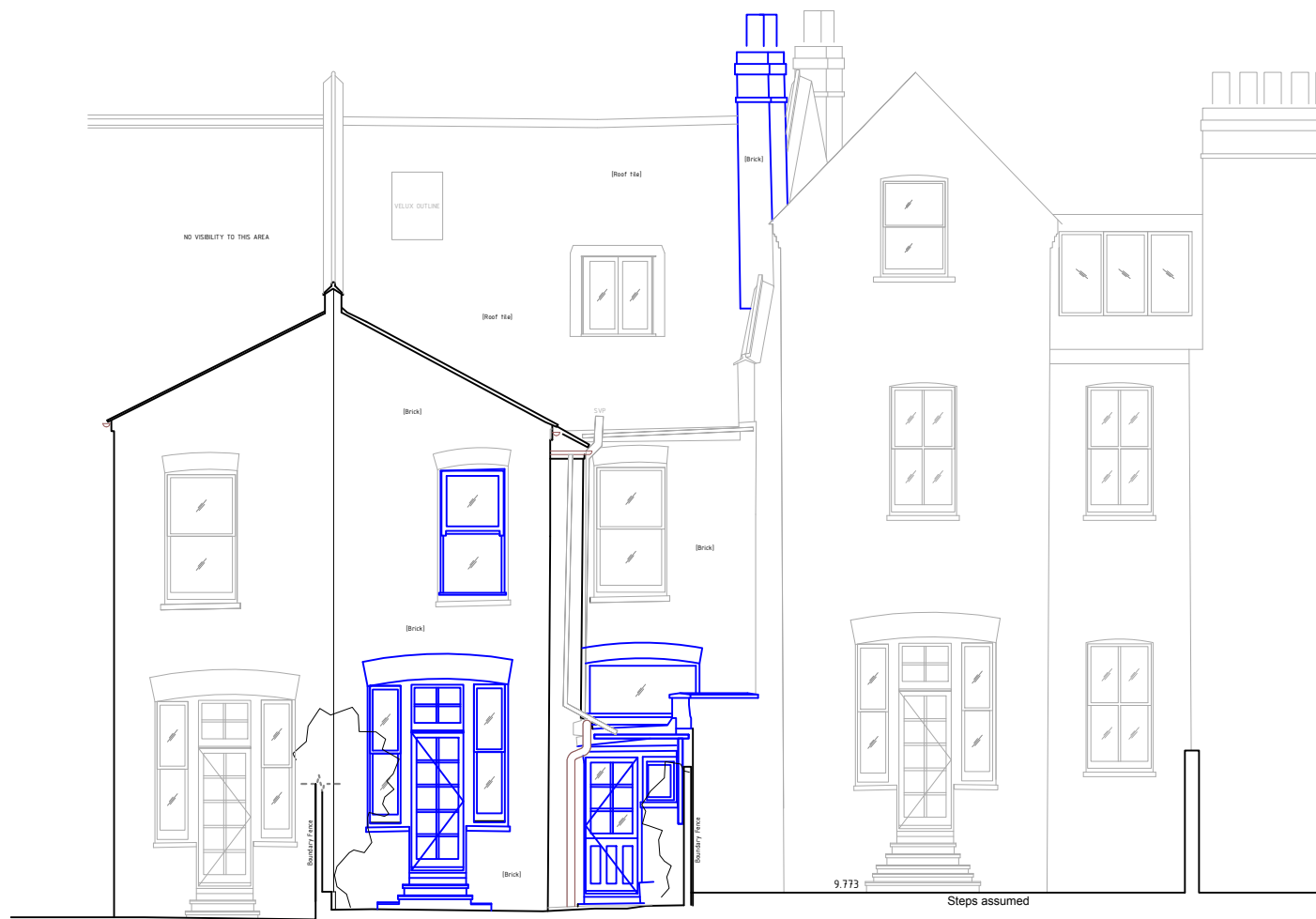
Existing Rear Elevation Scale: 1:100