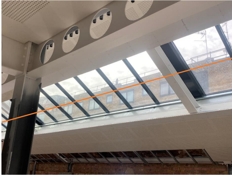
Photograph 8: View from First Floor Mezzanine (obscured below approximate orange line)