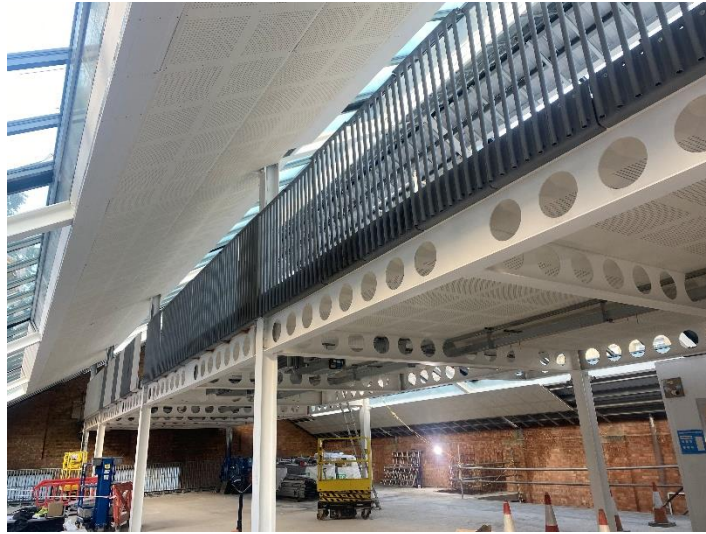
Photograph 6: View from First Floor Mezzanine (obscured below approximate orange line)