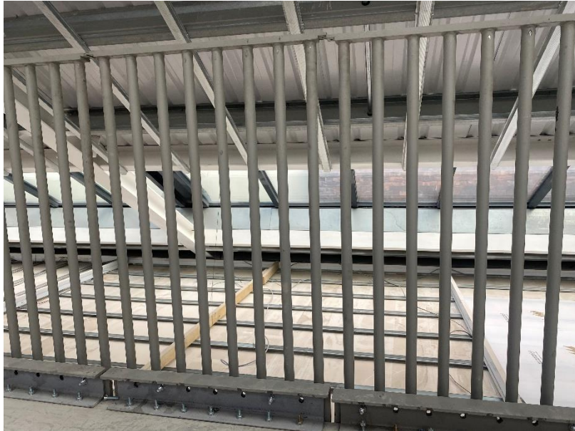
Photograph 10: Example of obscure glazing finish which has been installed