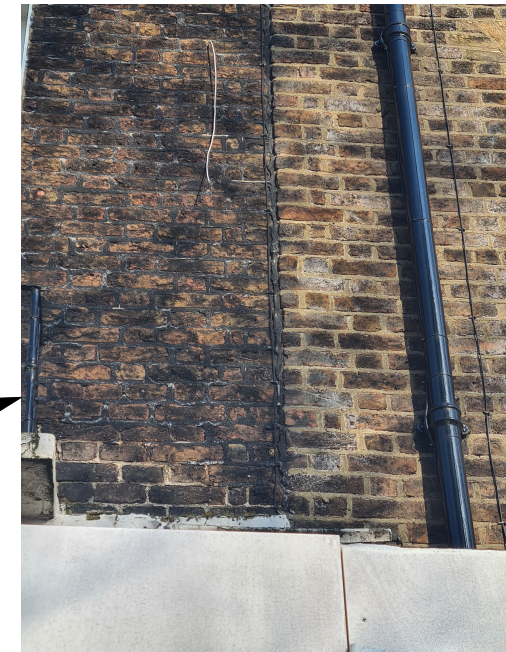
Example of poor condition grouting, many years of dirt and erosion.