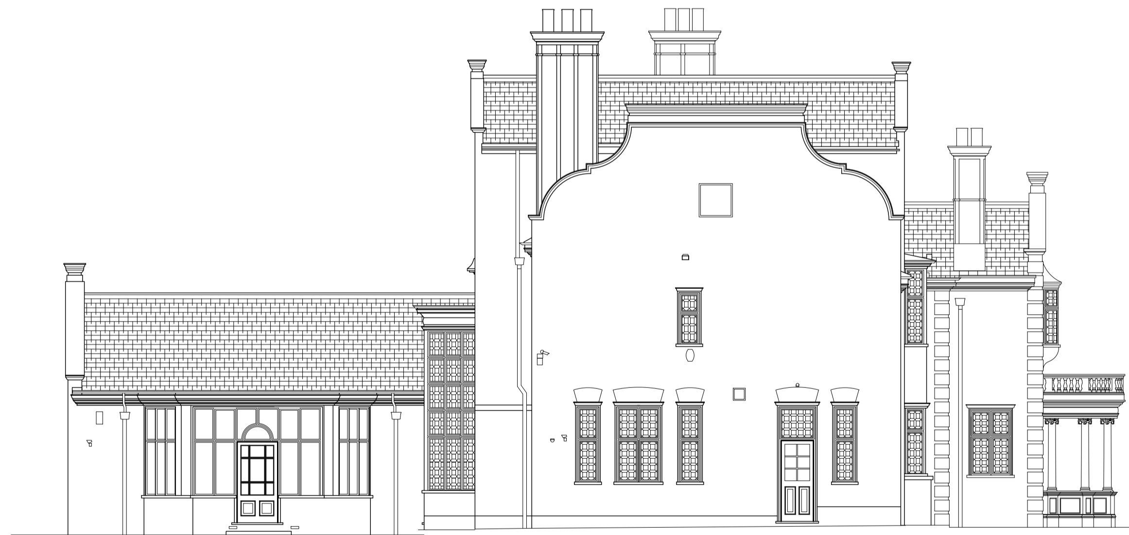
EXISTING SIDE (NORTH-EAST) ELEVATION

General Notes: Report all errors, omissions and discrepancies. Verify all dimensions on site before commencing any work on site or preparing any shop drawings. All materials, components and workmanship are to comply with the relevant British Standards, Codes of Practice and appropriate manufacturers' recommendations that from time to time shall apply. this drawing and design remains the property of SIAW and may not be reproduced in any way without prior consent.