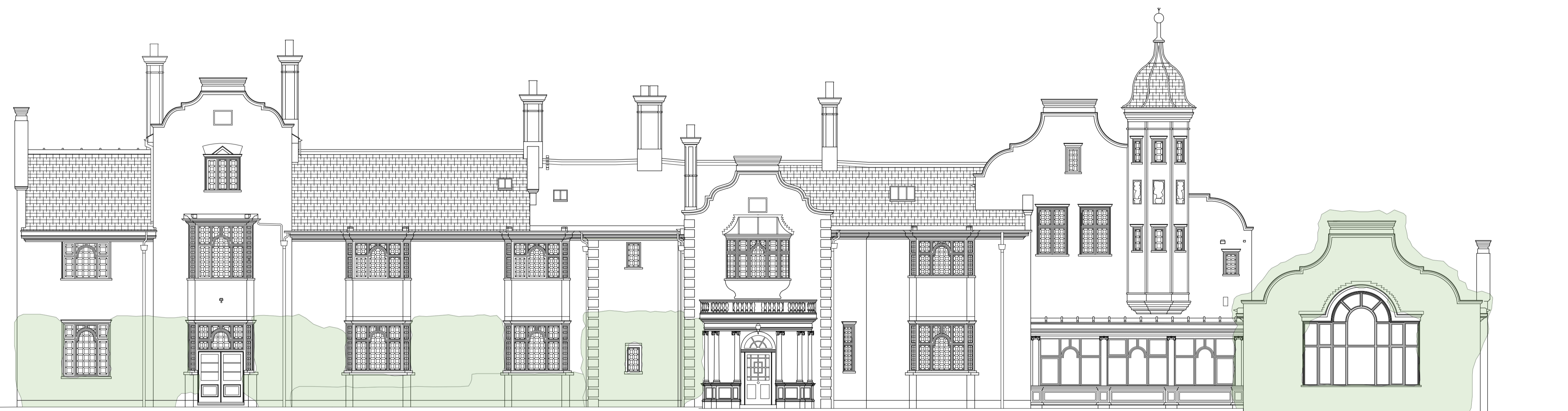
EXISTING FRONT (NORTH-WEST) ELEVATION

General Notes: Report all errors, omissions and discrepancies. Verify all dimensions on site before commencing any work on site or preparing any shop drawings. All materials, components and workmanship are to comply with the relevant British Standards, Codes of Practice and appropriate manufacturers' recommendations that from time to time shall apply. this drawing and design remains the property of SIAW and may not be reproduced in any way without prior consent.