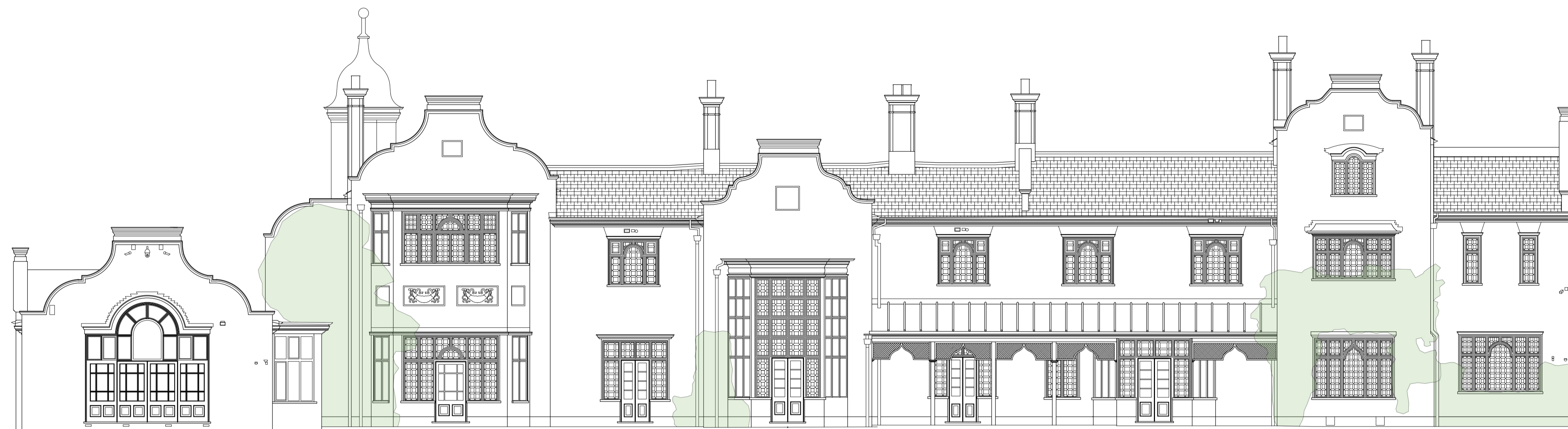
EXISTING REAR (SOUTH-EAST) ELEVATION