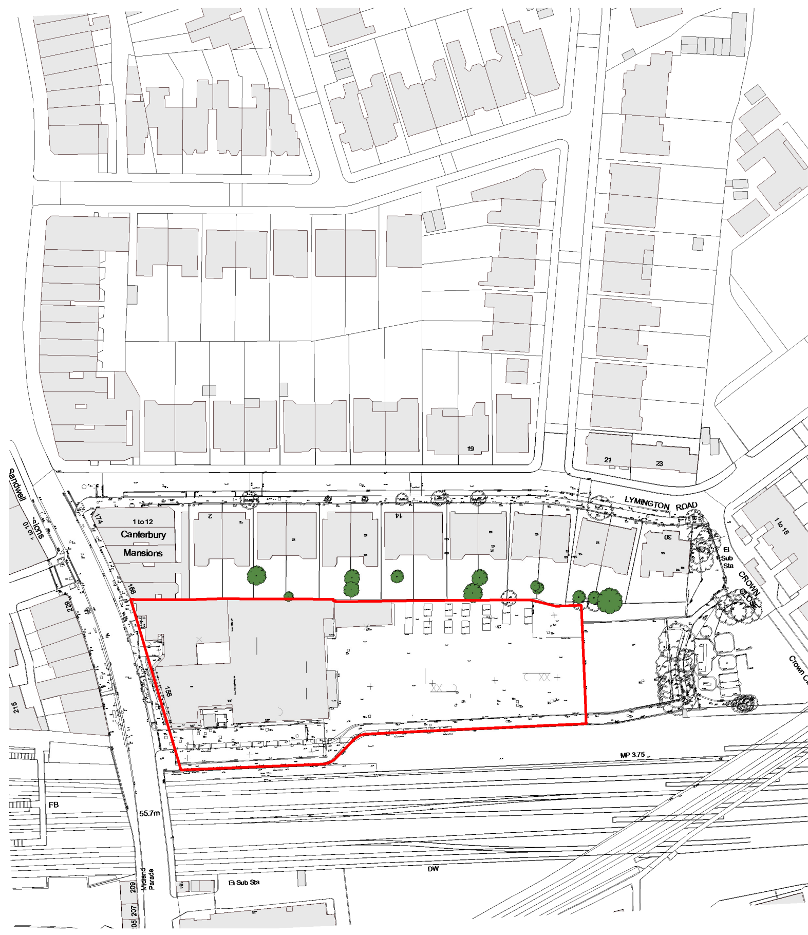
1 Location Plan 1 : 1250

NOTES - Do not scale from this drawing, except for planning purposes. - Check all dimensions on site. - Subject to survey. - Subject to site inspection. - Site boundary lines are indicative only.