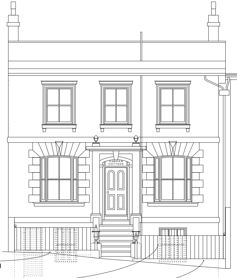
Front Elevation as Proposed