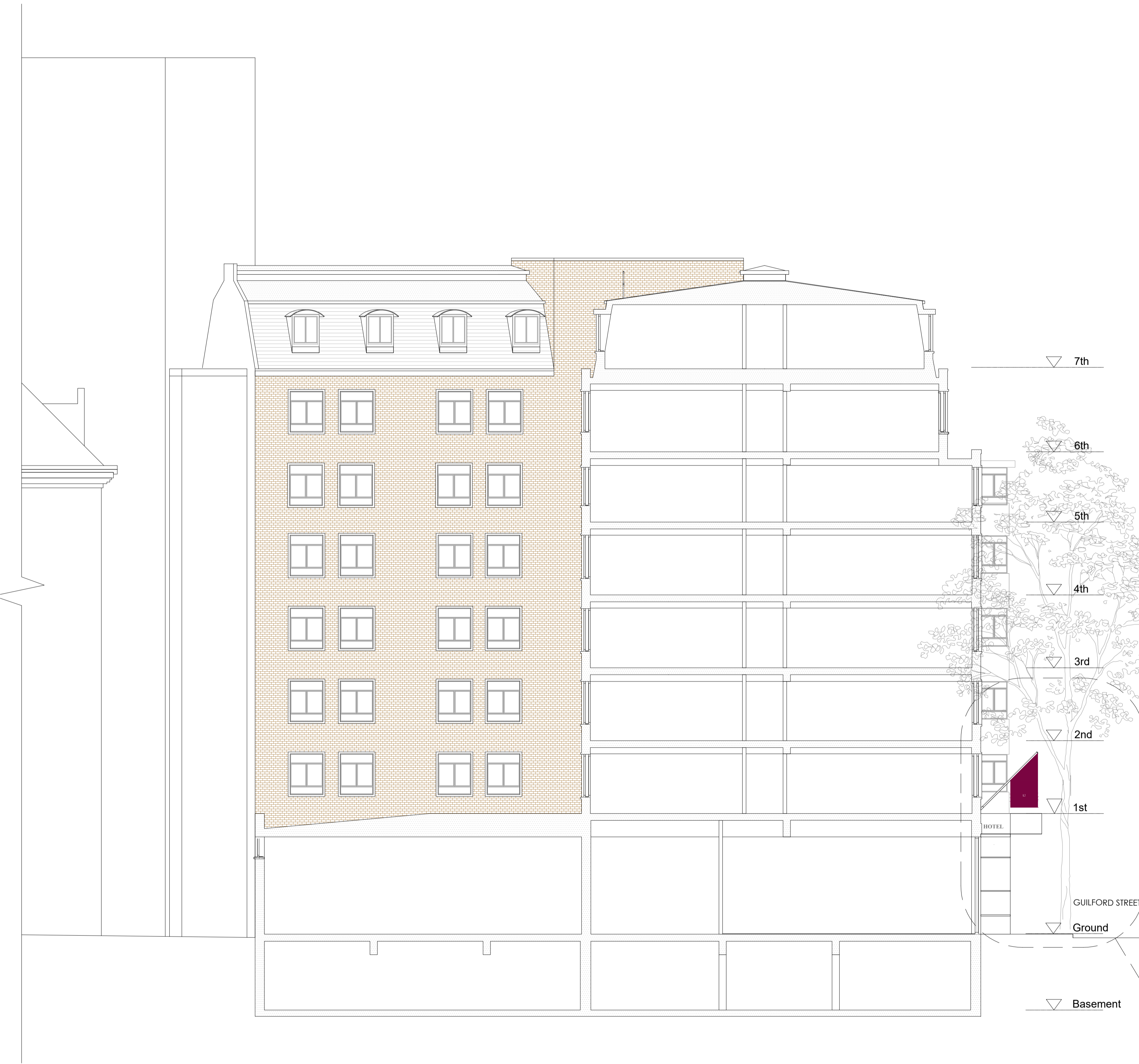
1 SECTION A-A Scale: 1:100 @ A1