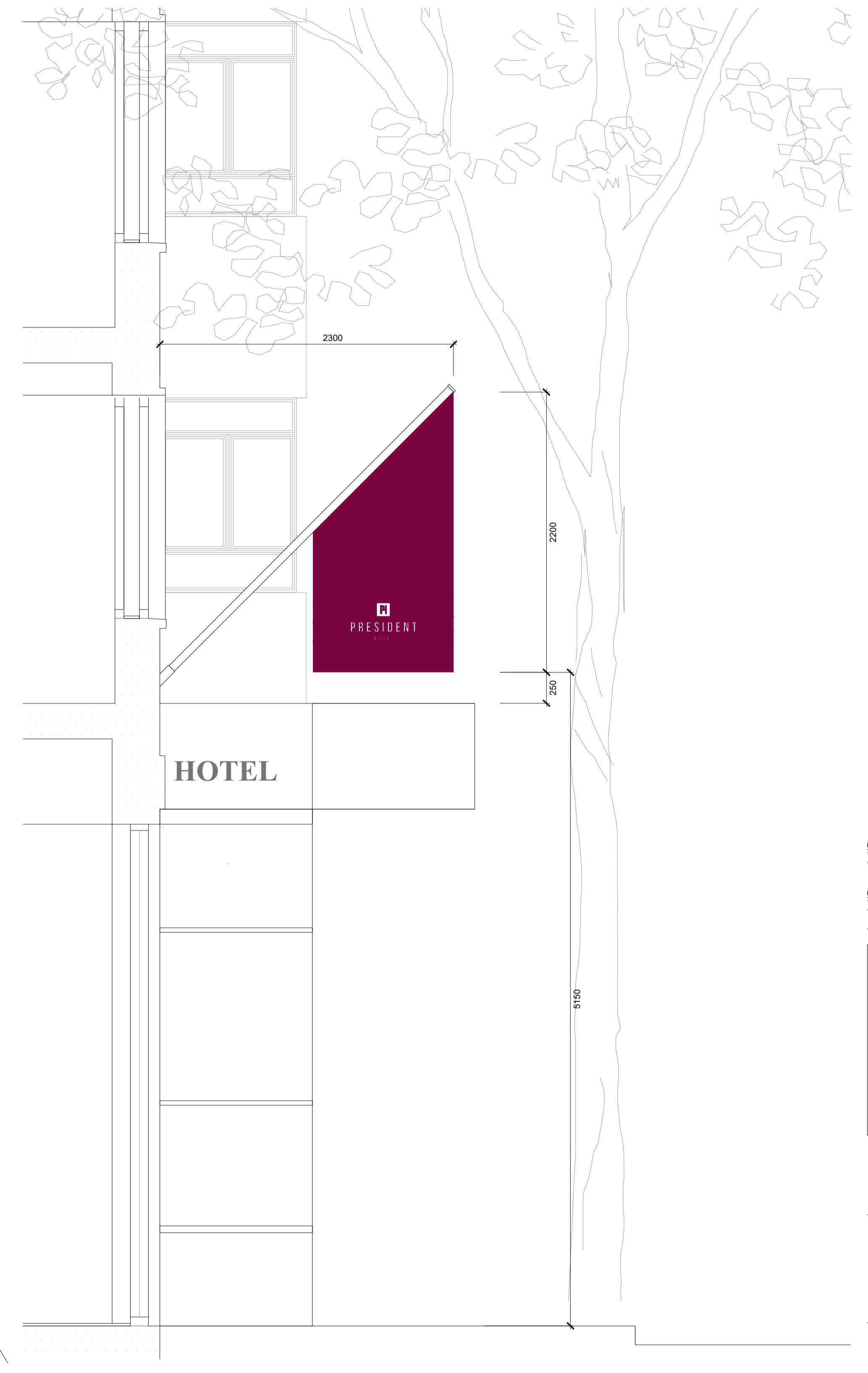
1 DETAIL SECTION A-A Scale: 1:25 @ A1