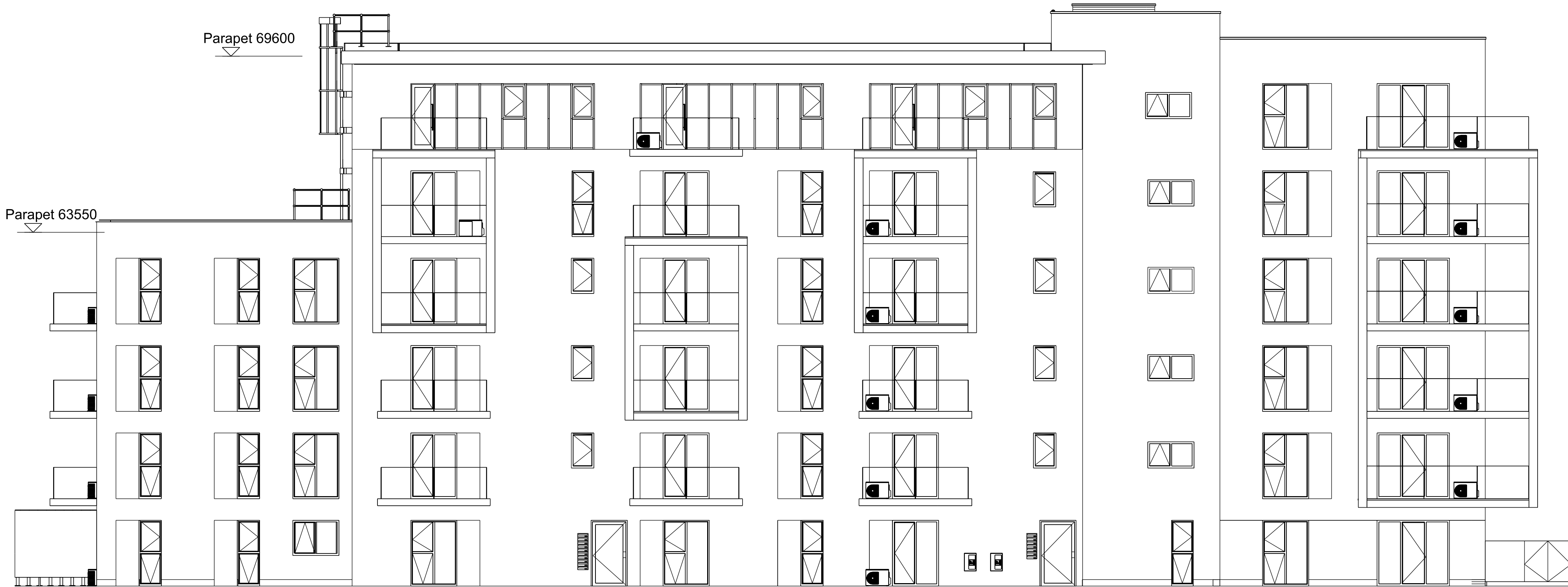
1 Block G Scale 1:200 at A3