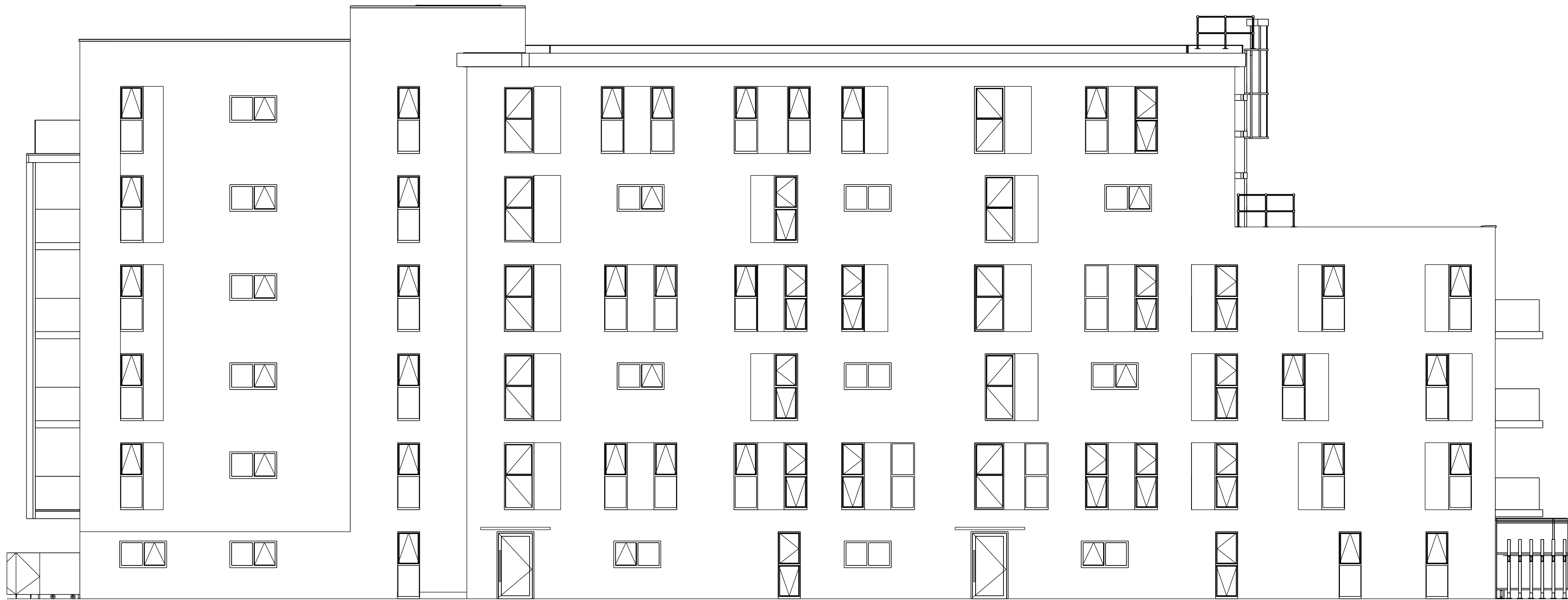
3 Block G Scale 1:200 at A3