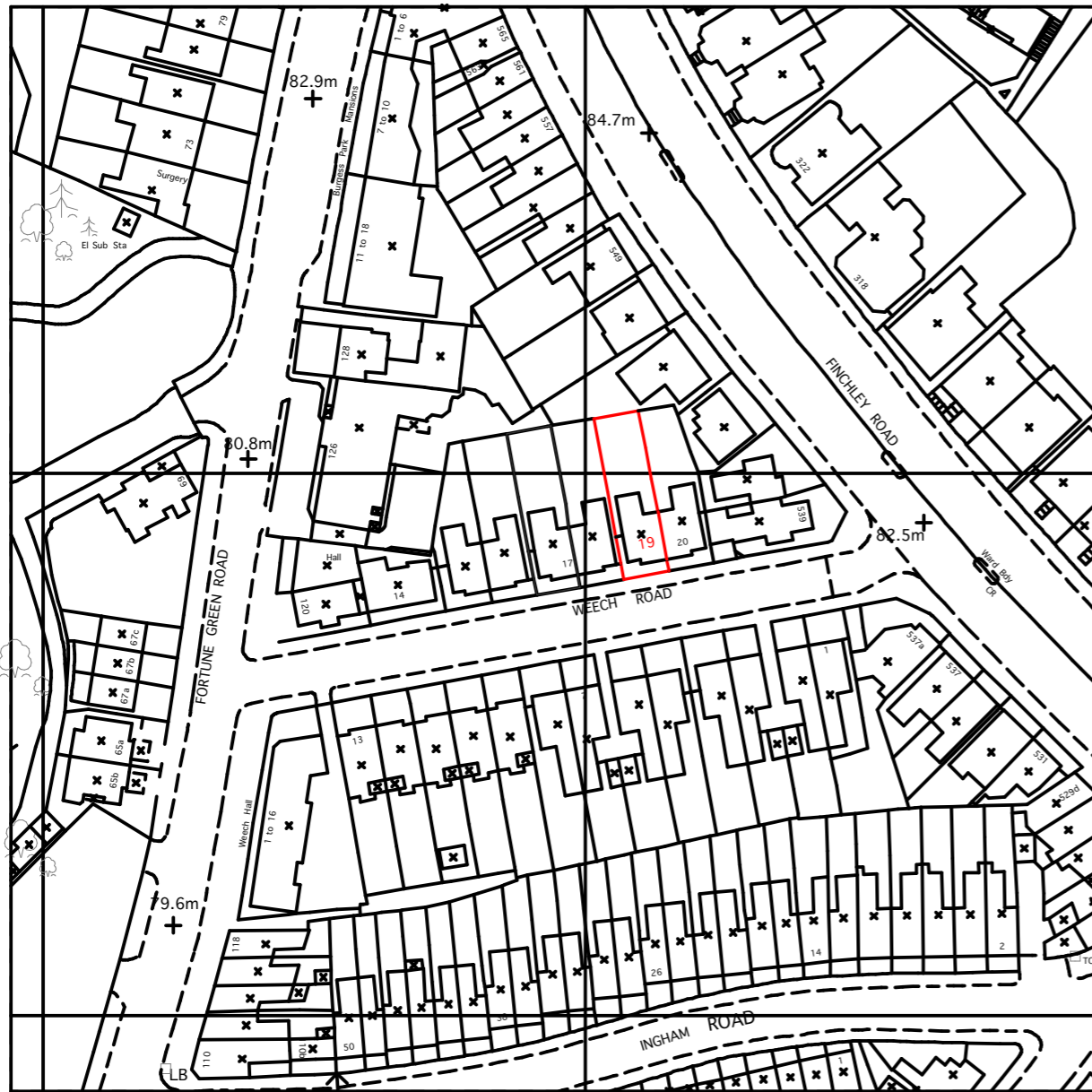
SITE PLAN SCALE 1:1250