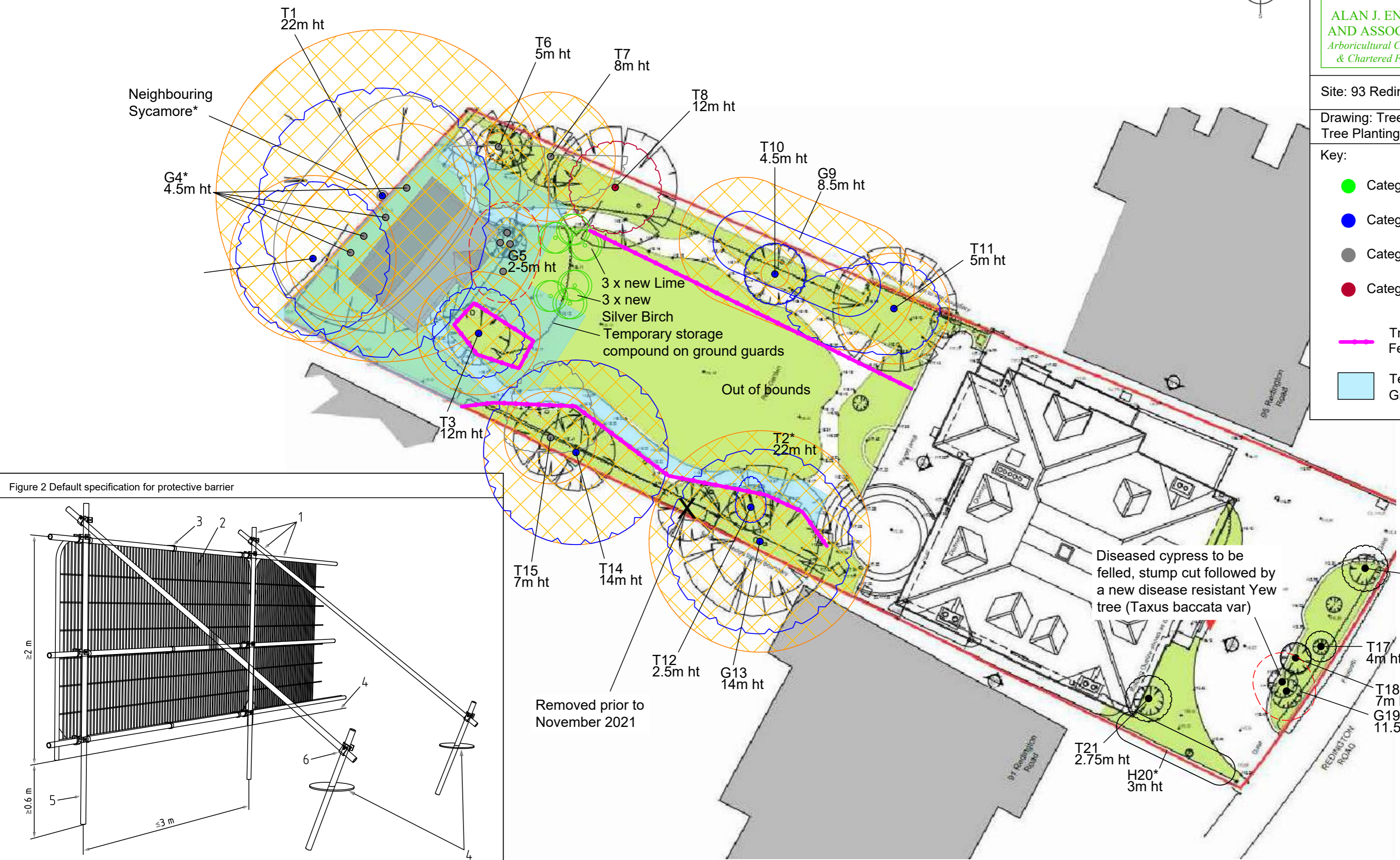
Figure 2 Default specification for protective barrier