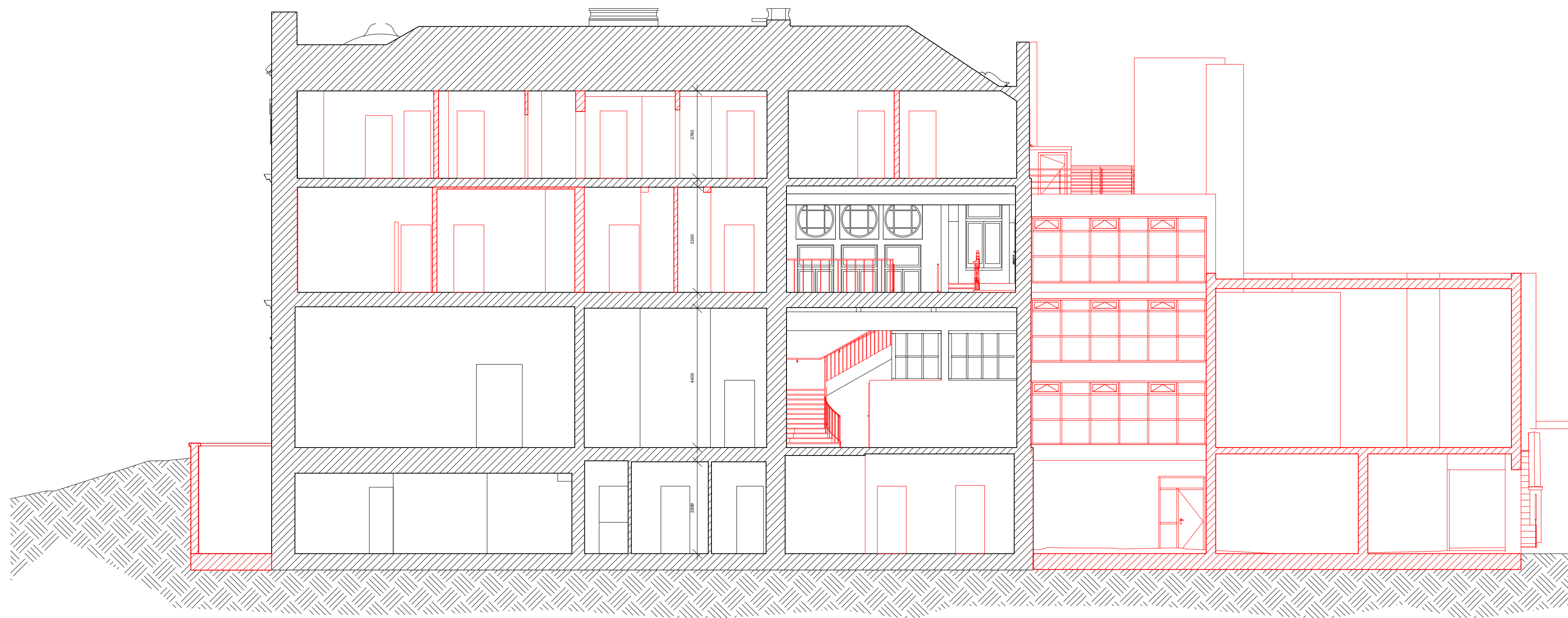
2 EXISTING AND REMOVAL SECTION E-E PL-16 Scale: 1:100