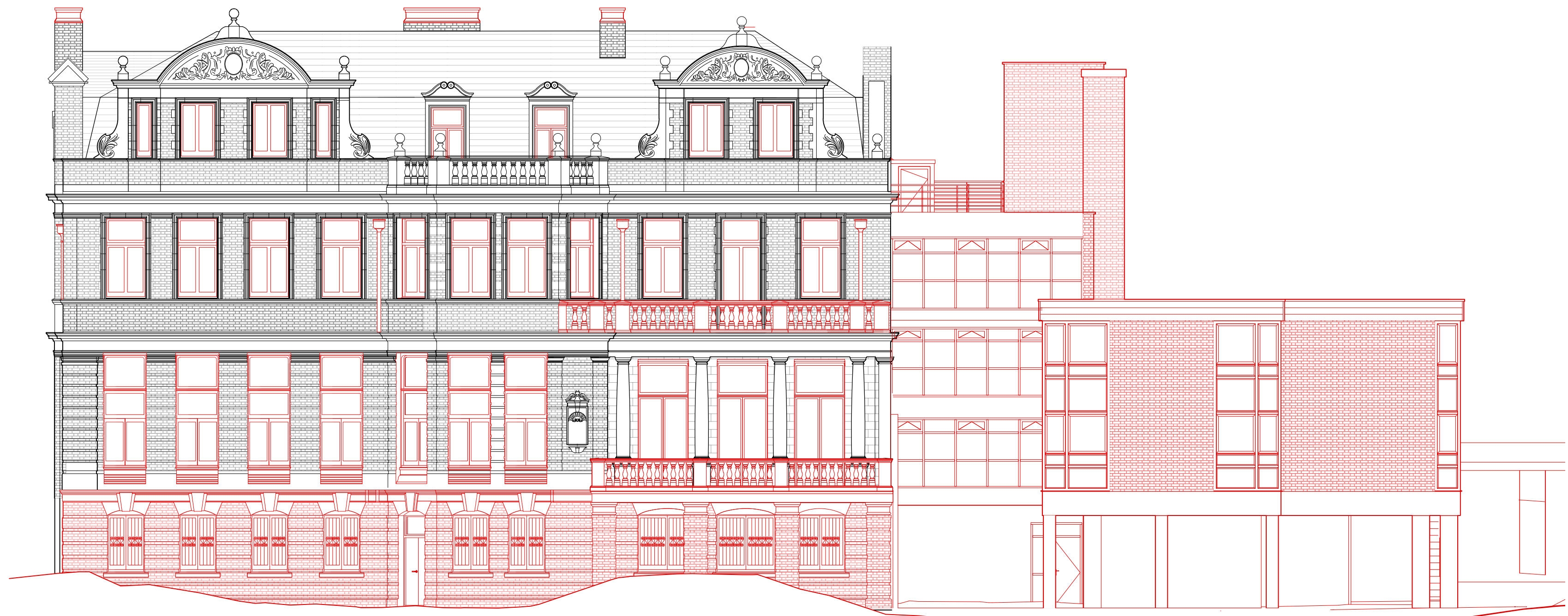
2 DEMOLITION SOUTH - WEST ELEVATION PL-15 Scale: 1:100