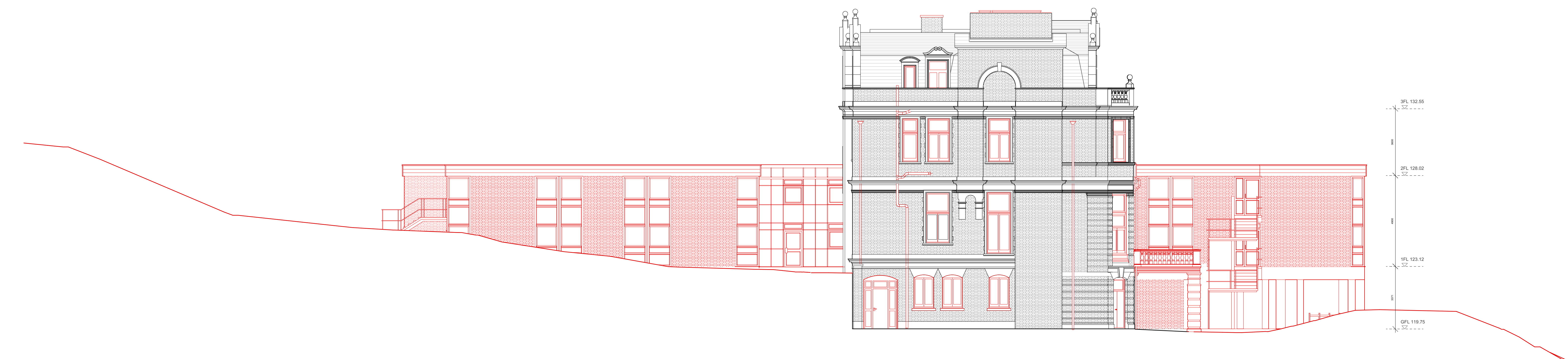
3 DEMOLITION NORTH - WEST ELEVATION PL-15 Scale: 1:100