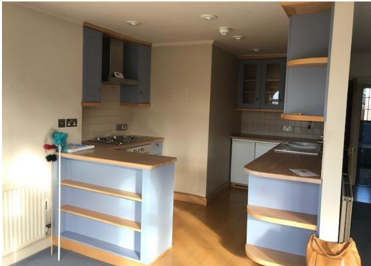
REDUCE HEIGHT OF KITCHEN DIVIDING WALL TO WORKTOP HEIGHT