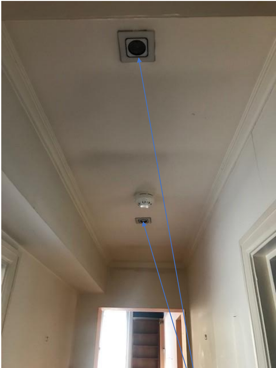
EXISTING CORRIDOR DOWN LIGHTING