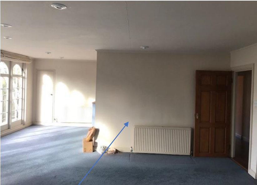
REDUCE HEIGHT OF KITCHEN DIVIDING WALL TO WORKTOP HEIGHT