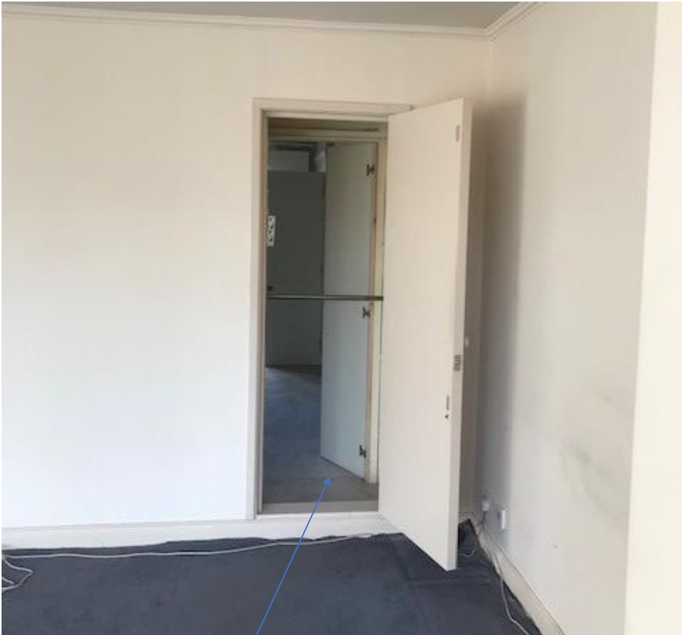
BLOCK DOORWAY TO BACK OF BEDROOM 1 WARDOBES FROM LIVING ROOM