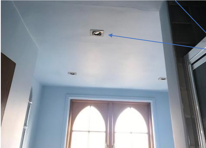
EXISTING BATHROOM RECESSED DOWN LIGHTING