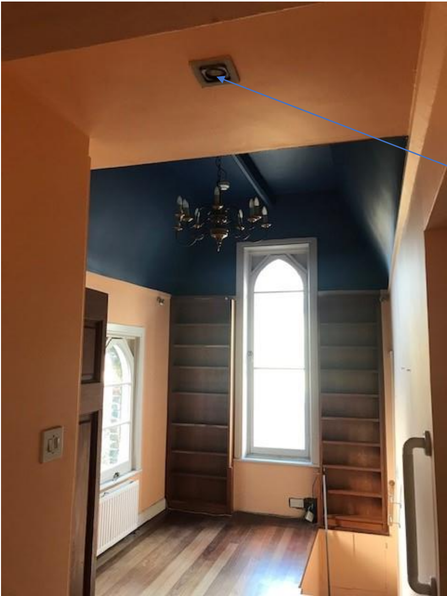
EXISTING CORRIDOR RECESSED DOWN LIGHT