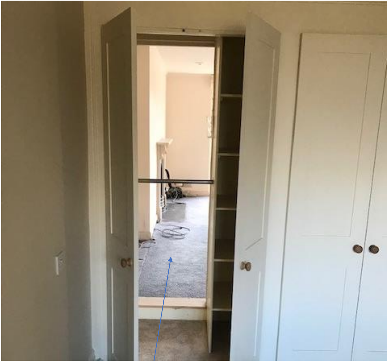
BLOCK ACCESS TO BACK OF WARDROBE FROM LIVING ROOM