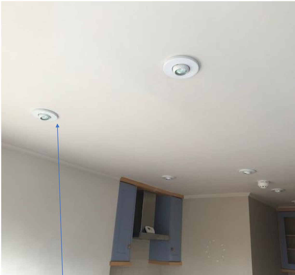
EXISTING KITCHEN RECESSED DOWN LIGHTING