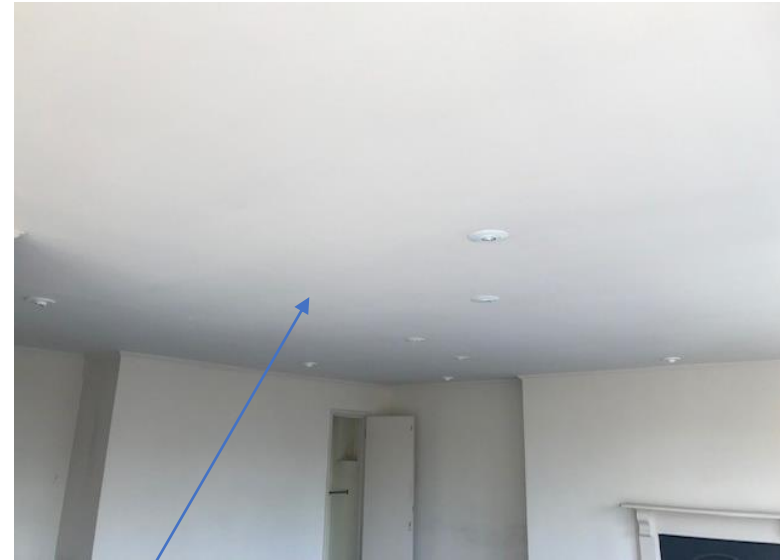
EXISTING LIVING RM RECESSED DOWN LIGHTING