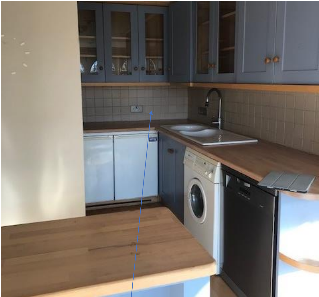
CREATE SEPERATE UTILITY CUPBOARD IN THIS AREA