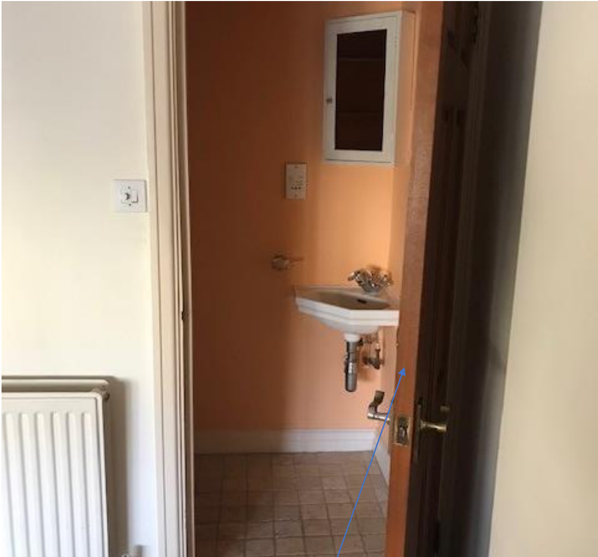
BLOCK DOOR TO CLOAKROOM