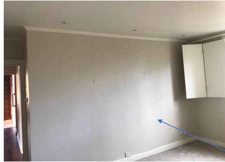
CREATE NEW DOOR OPENING TO ENSUITE BATHROOM