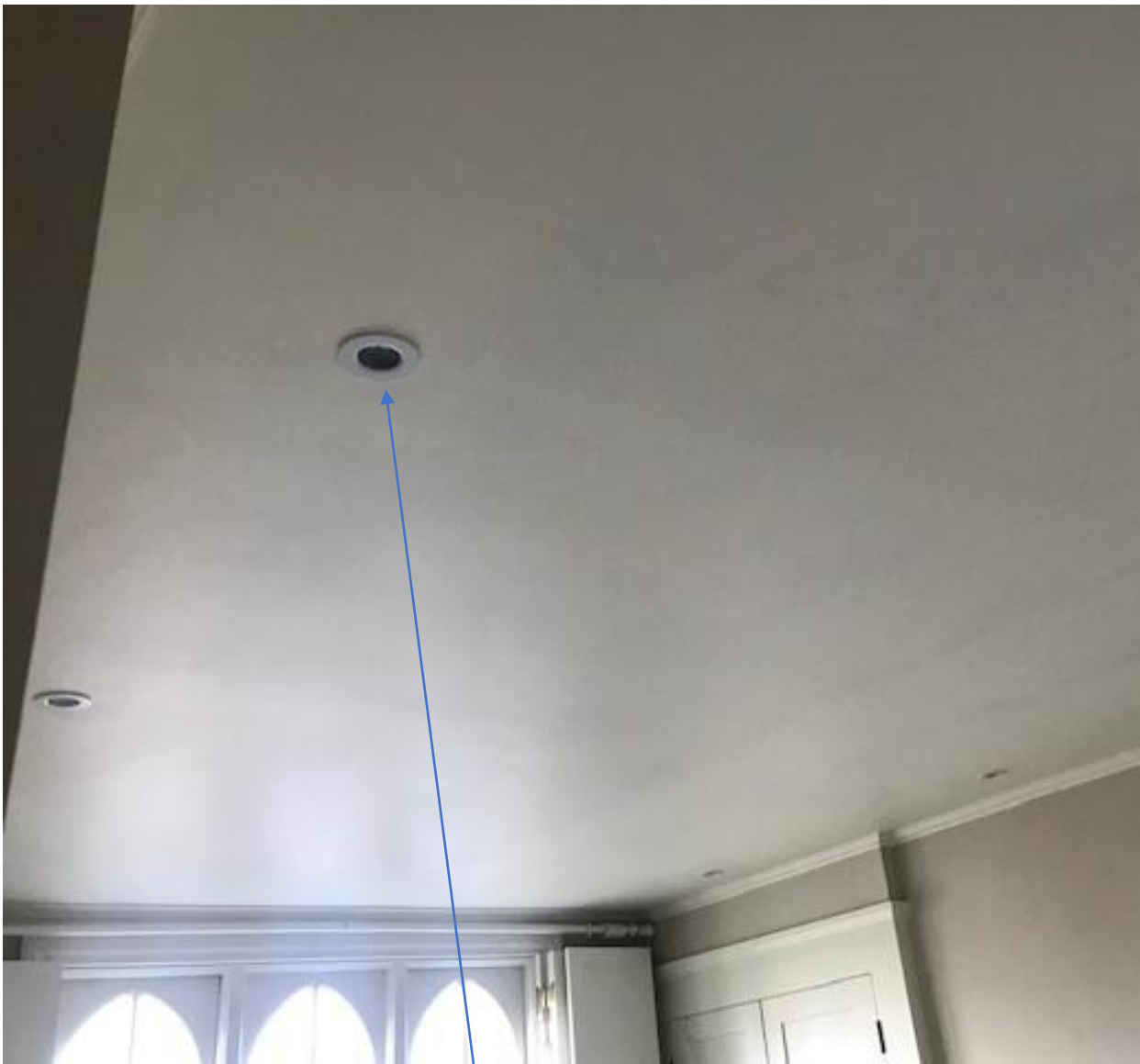
EXISTING BEDROOM 1 RECESSED DOWN LIGHTING