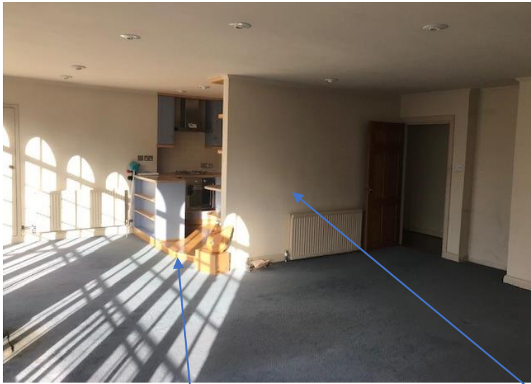
EXTEND KITCHEN AREA