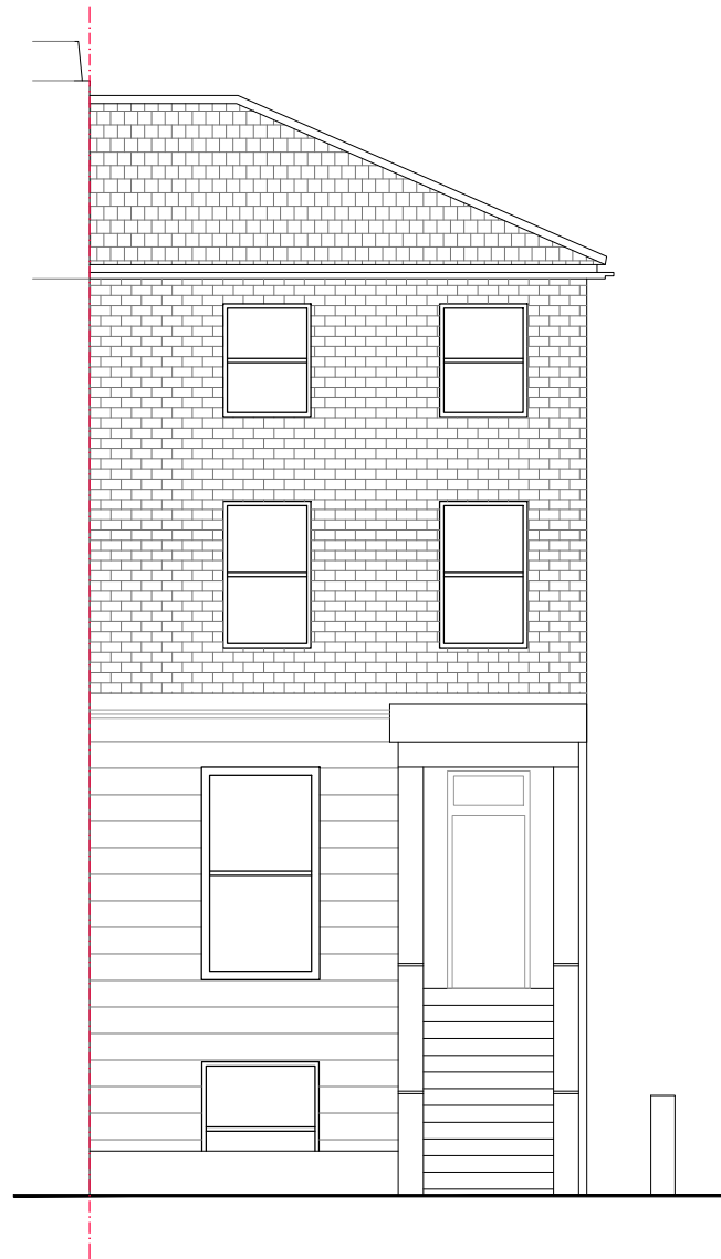
EXISTING FRONT ELEVATION (Remains as existing)