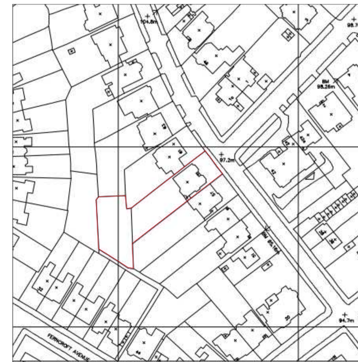
Proposed Location Plan 1 : 1250

Proposed Area Schedule: Plot area: 1,558 sqm Existing House Footprint: 293 sqm Proposal Footprint: 295 sqm