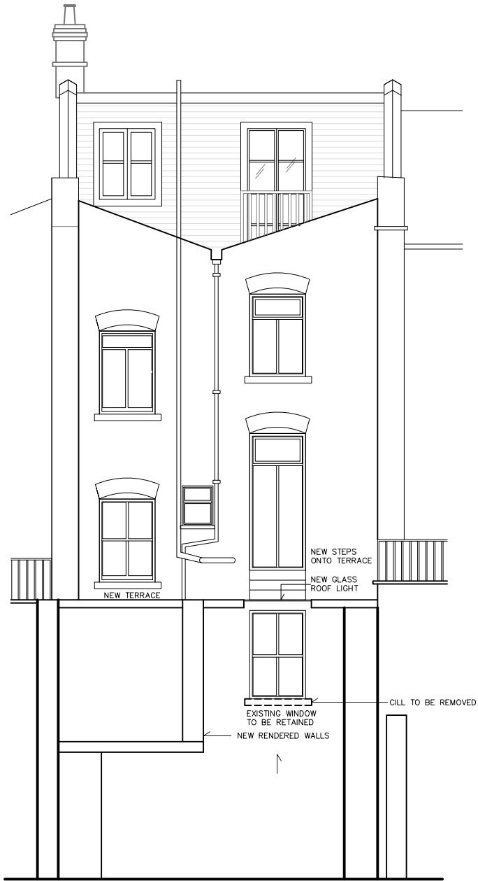
PROPOSED SECTION 'B'