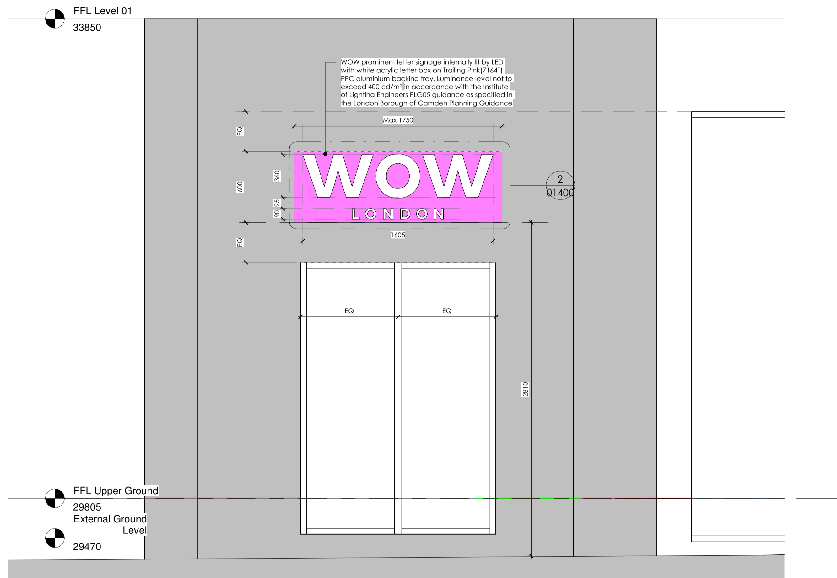
1 Planning_North Elevation A 1 : 20