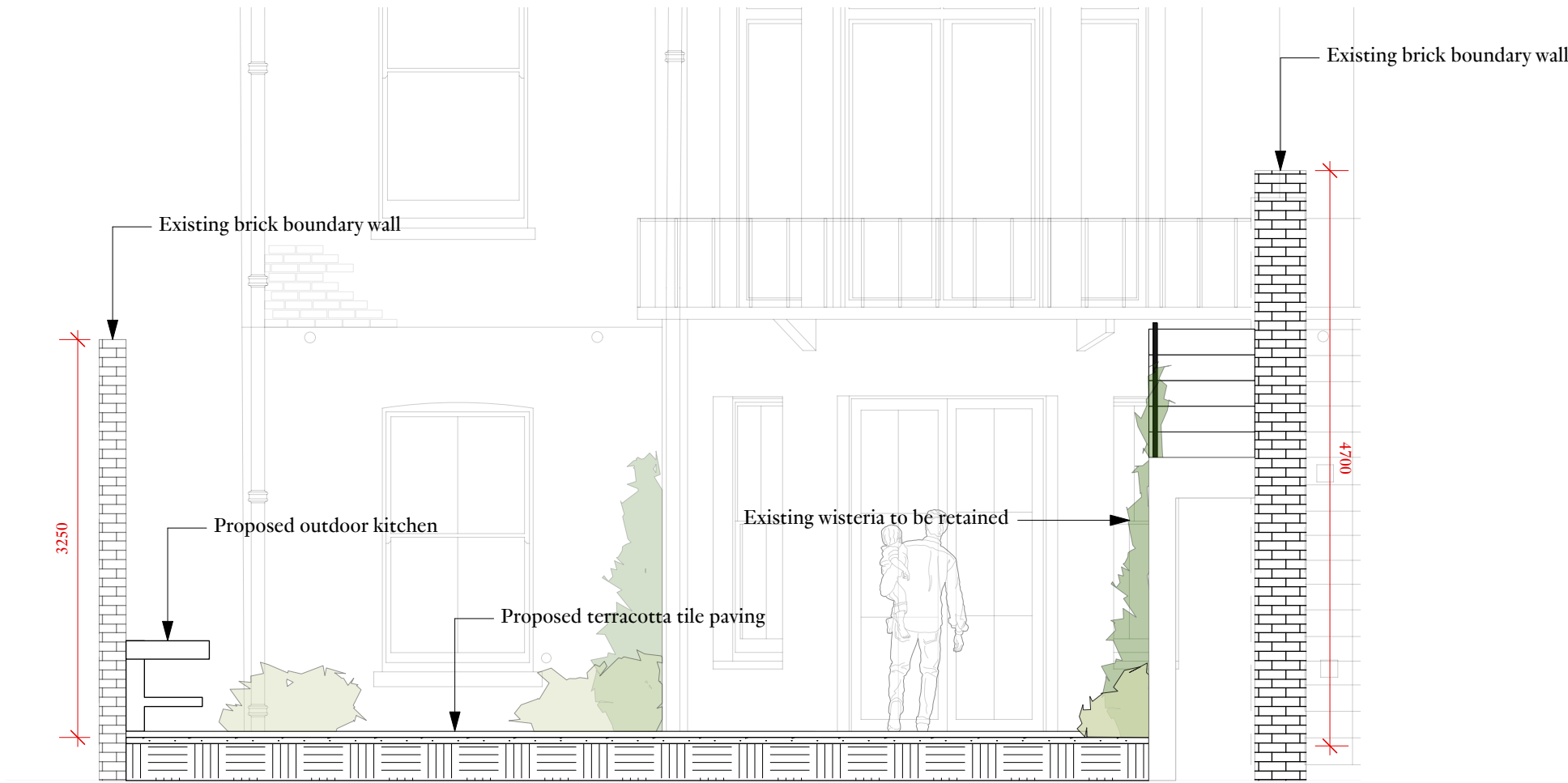
1 Rear Garden Section 1 203 1:50 at A2