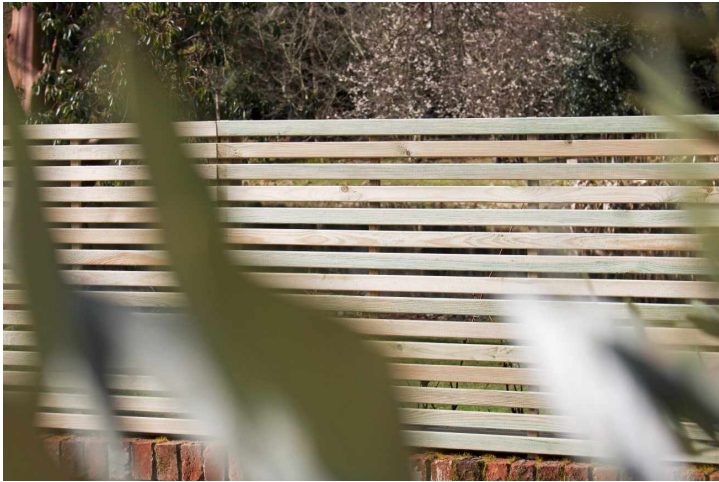
2. Indicative style of proposed trellis