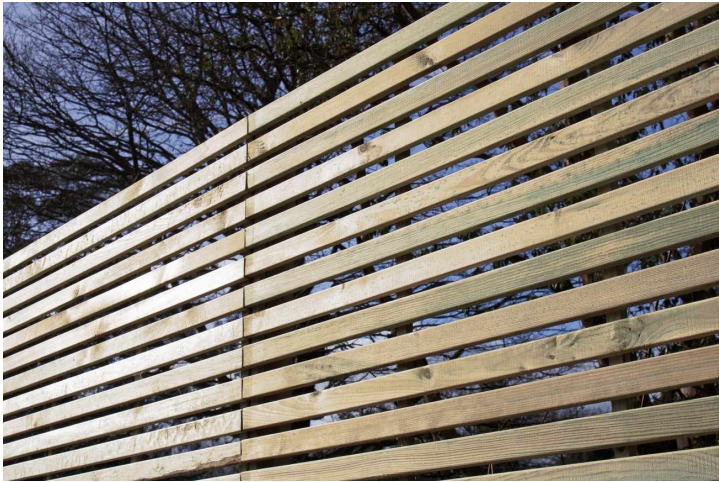
1. Indicative style of proposed trellis