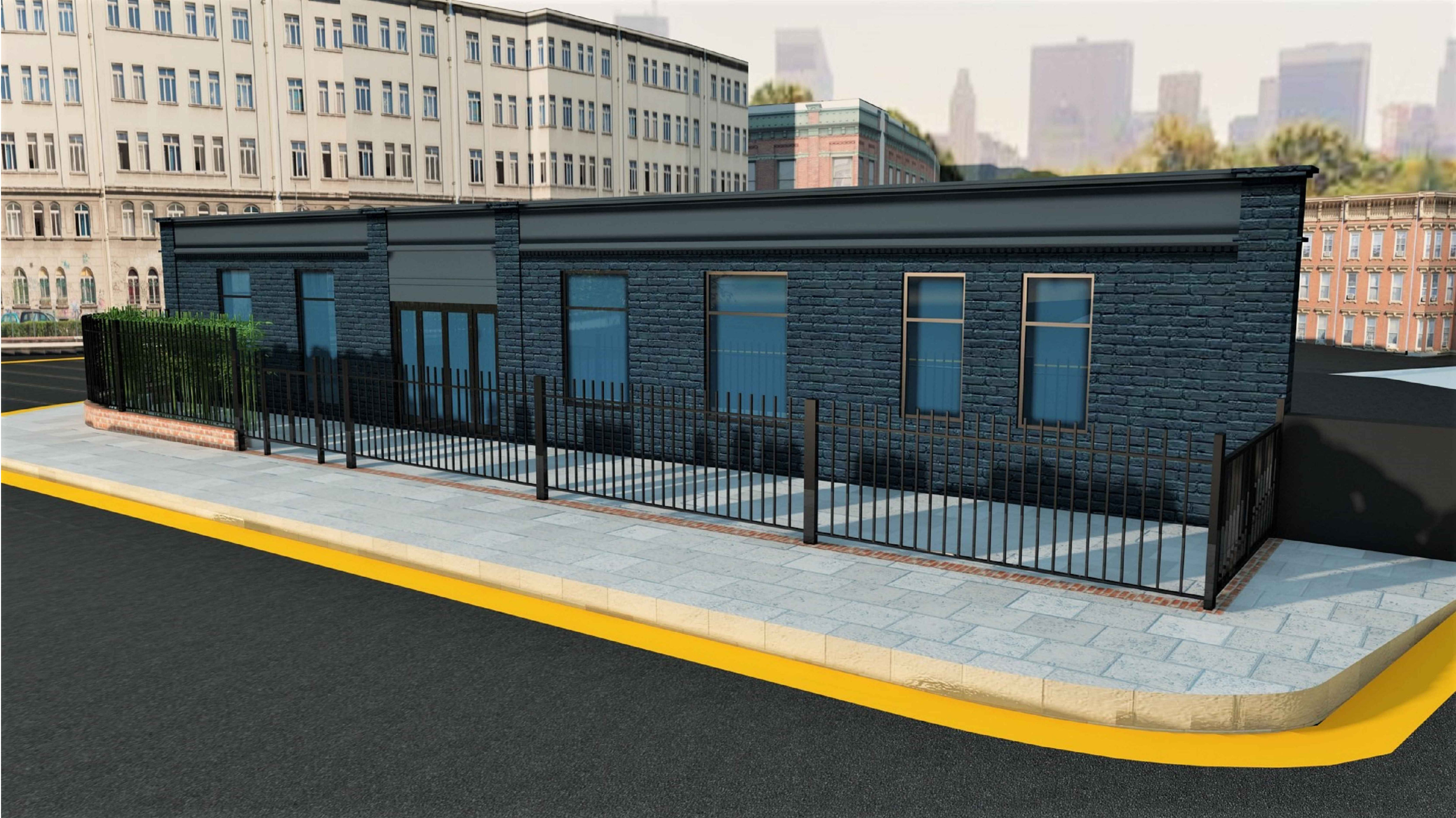
3D VIEW- 1