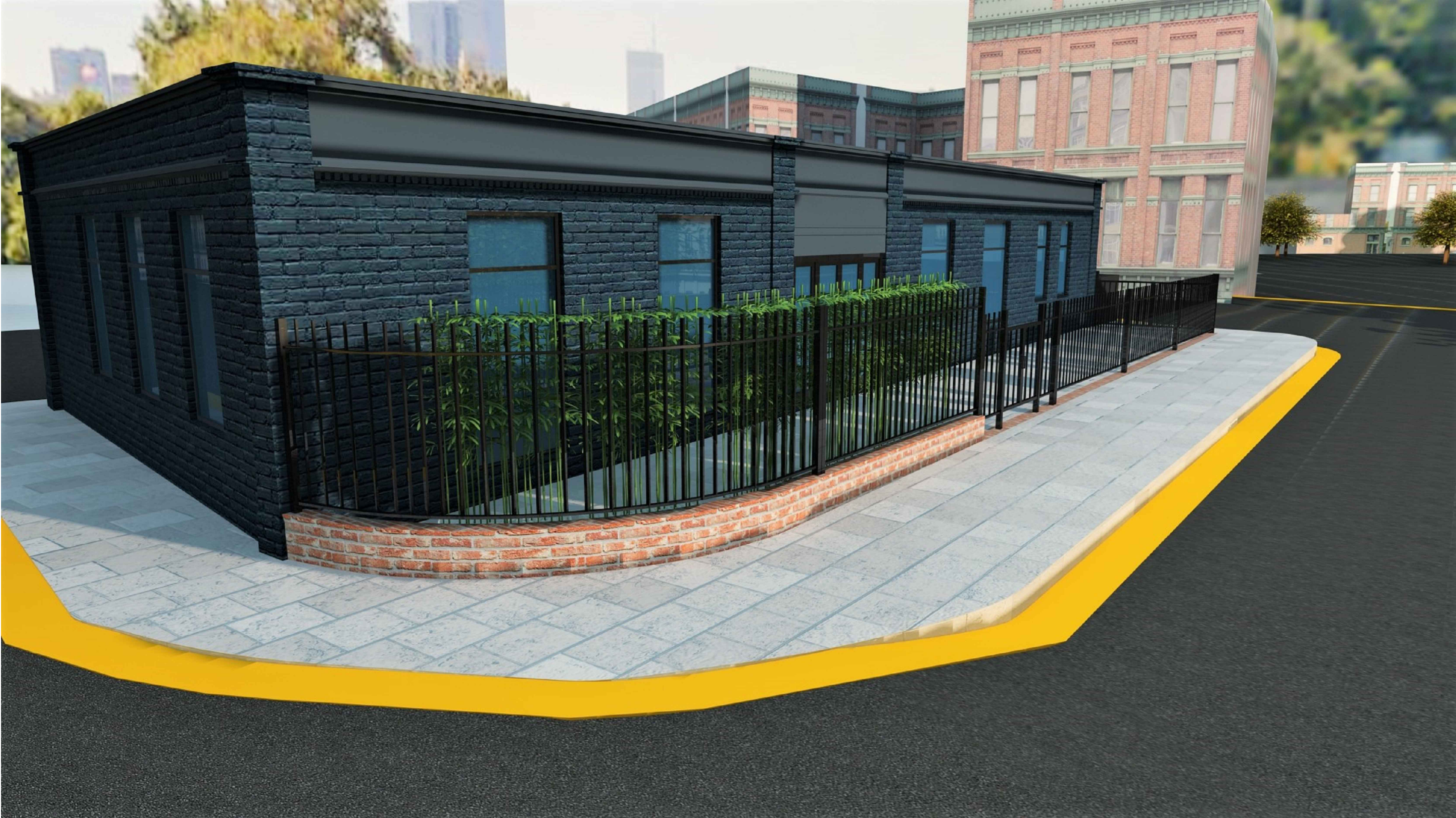
3D VIEW- 3