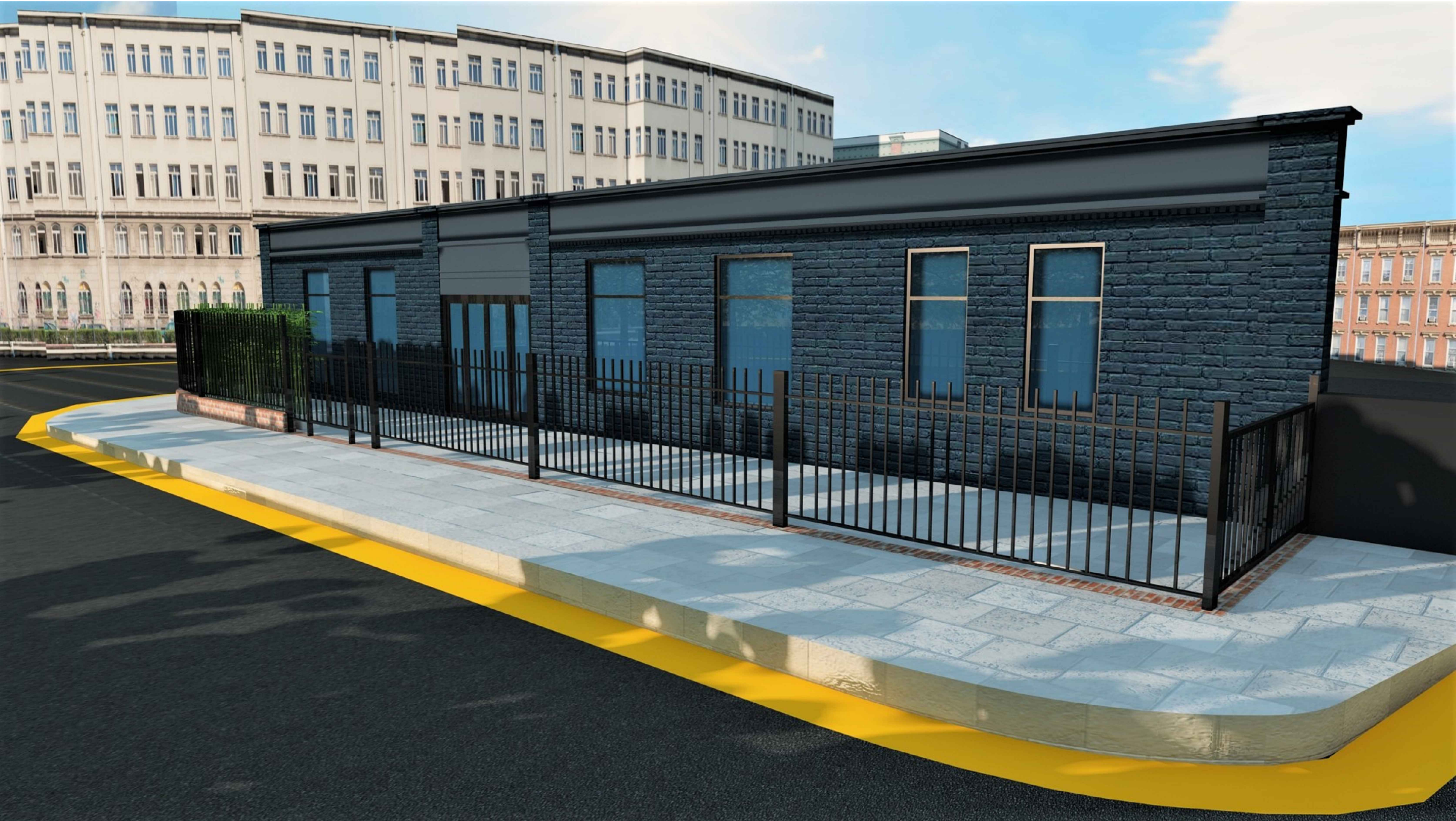
3D VIEW- 4