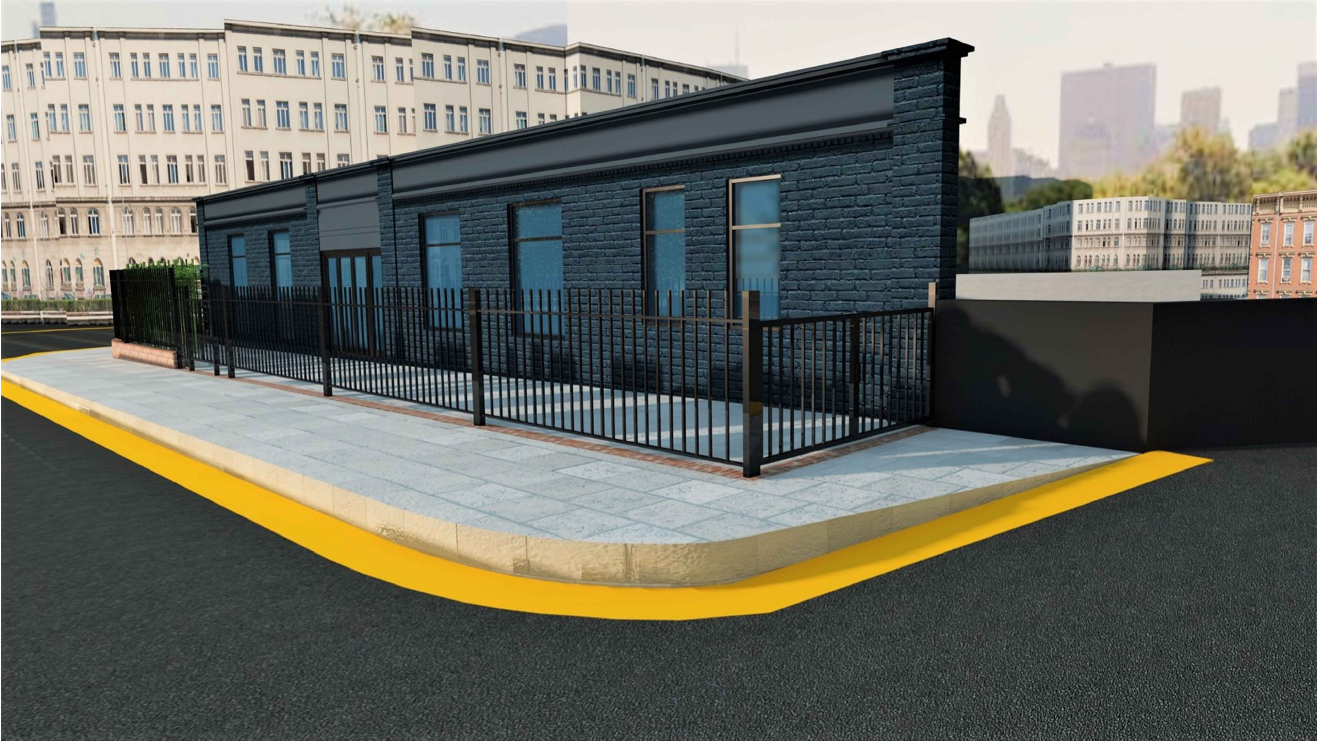
3D VIEW- 5 OF SIDE GATE