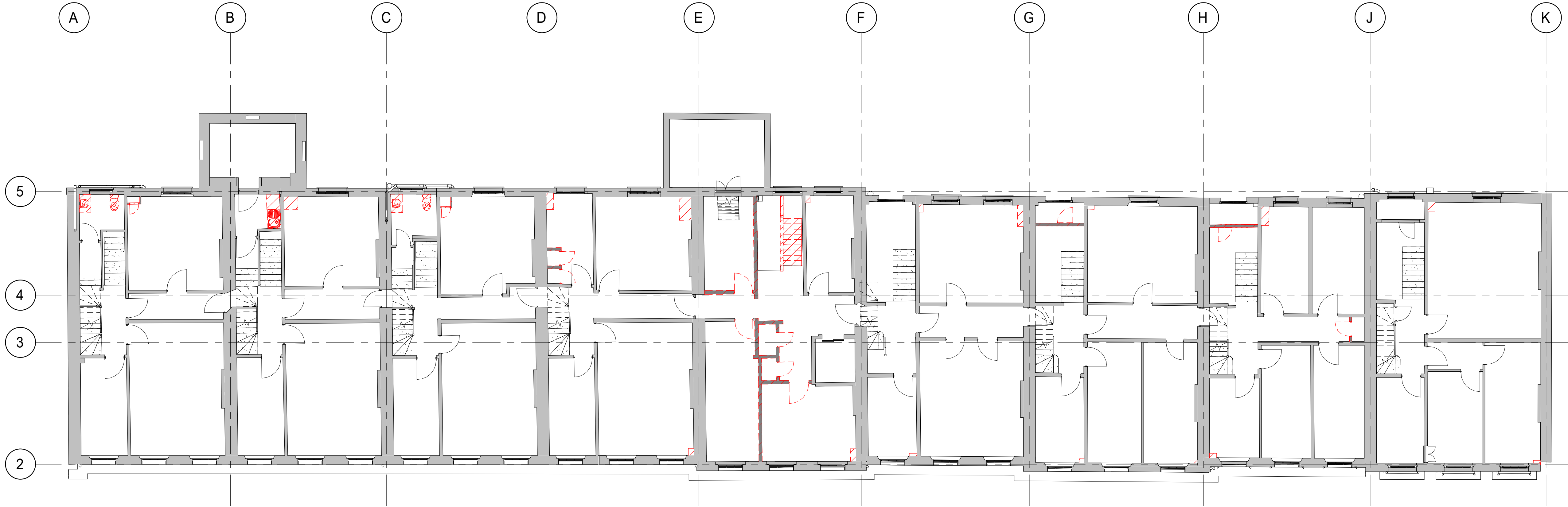
1. Planning - LEVEL 03 - Demolition Plan 1 : 100