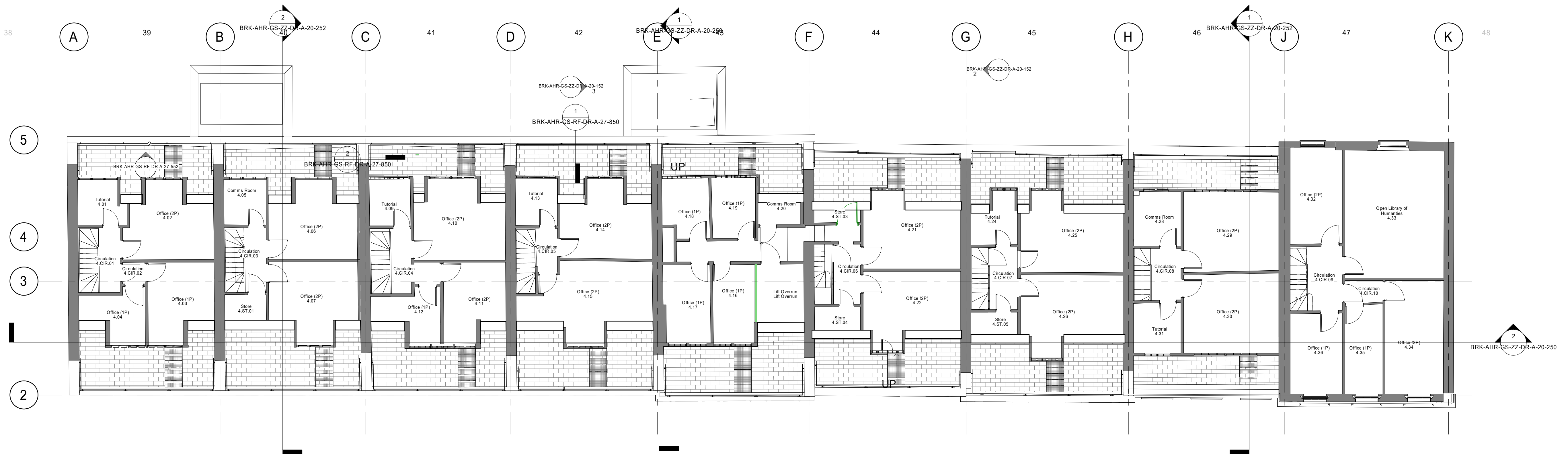
2. Planning - LEVEL 04 - Proposed 1 : 100

Existing elements - fabric (walls & doors) Proposed elements - fabric (walls & doors)