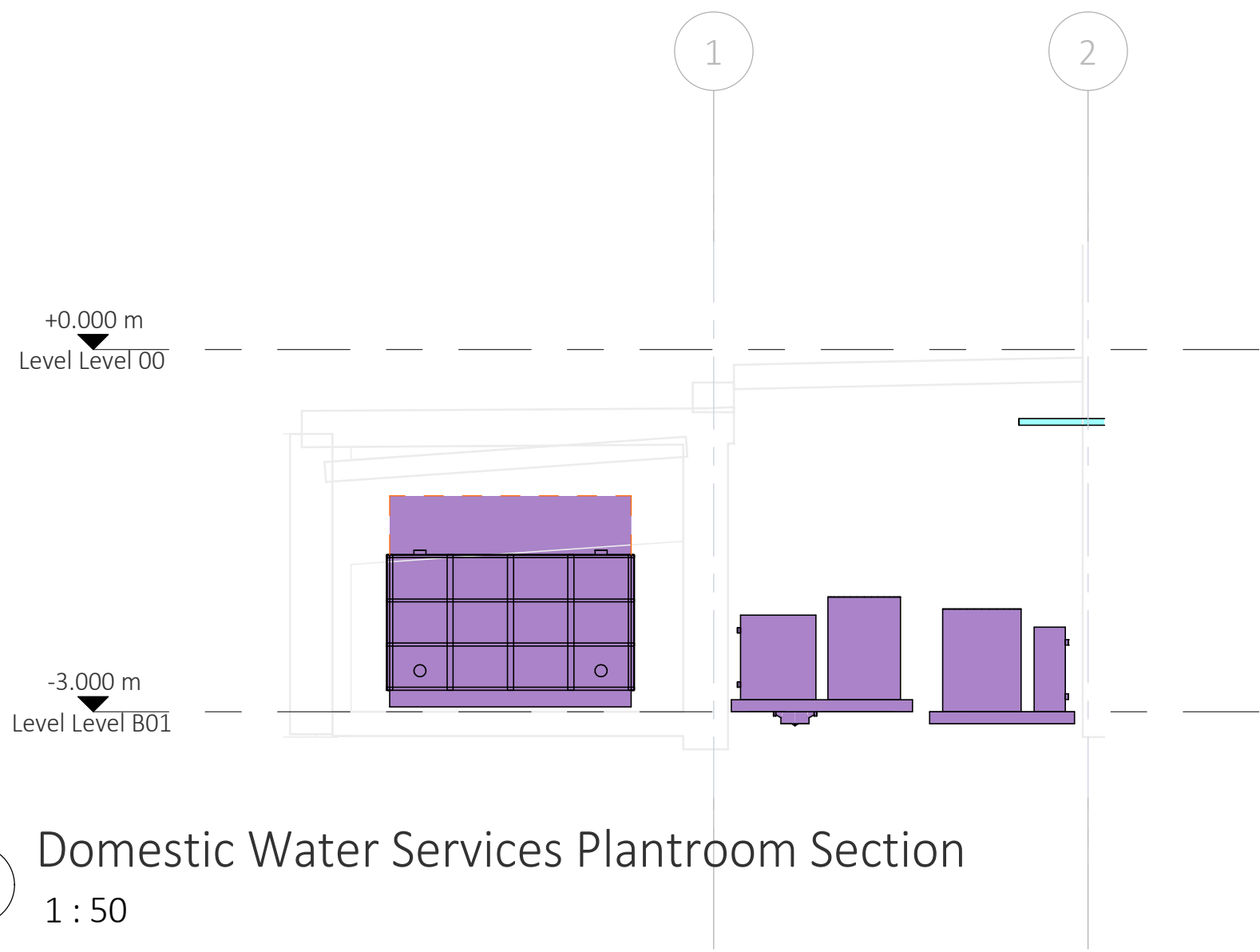
4 Domestic Water Services Plantroom Section 1 : 50