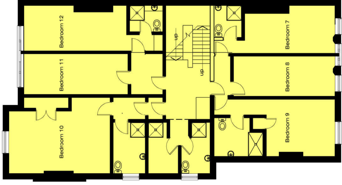
EXISTING 2nd Floor Area 145m 2