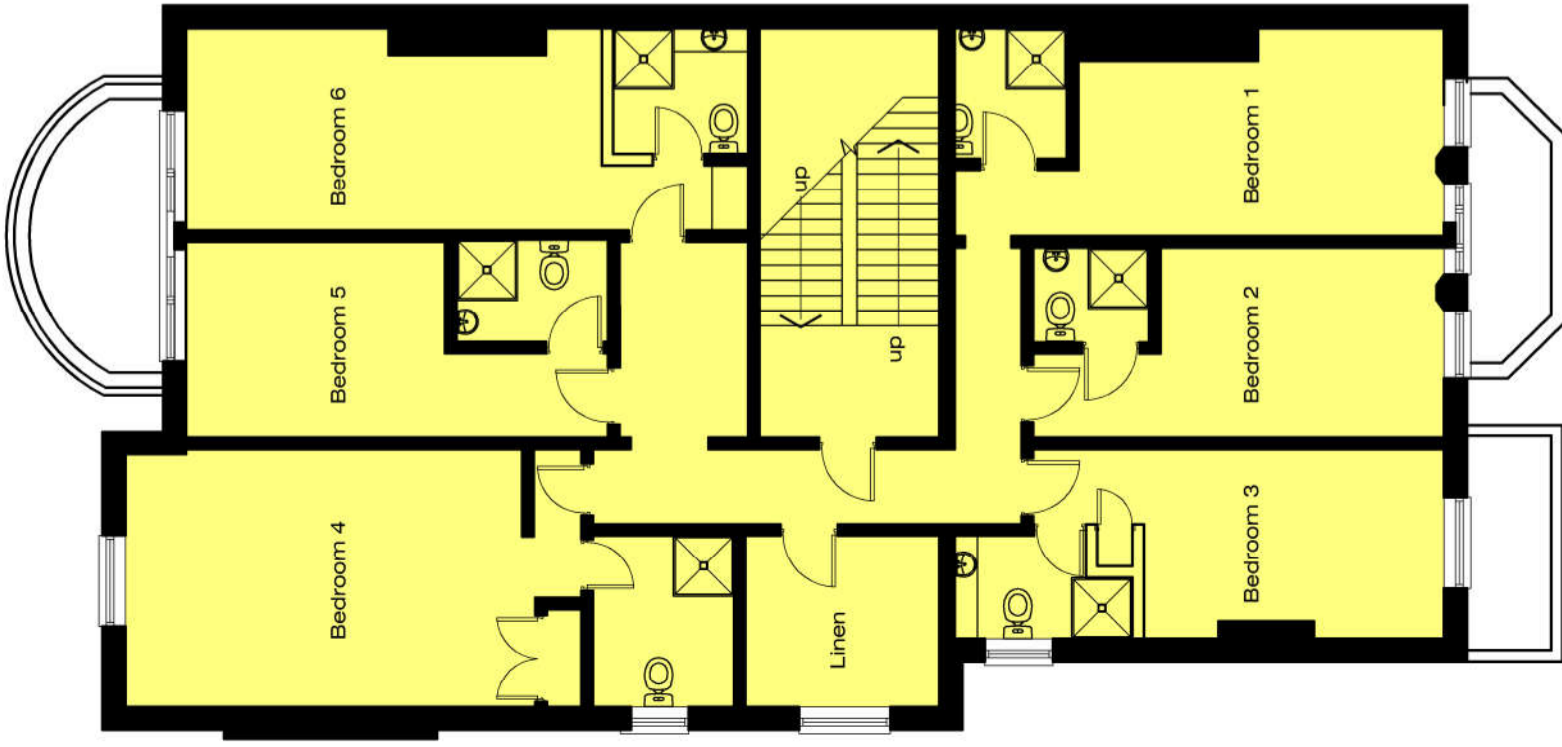
EXISTING 1st Floor Area 145m 2