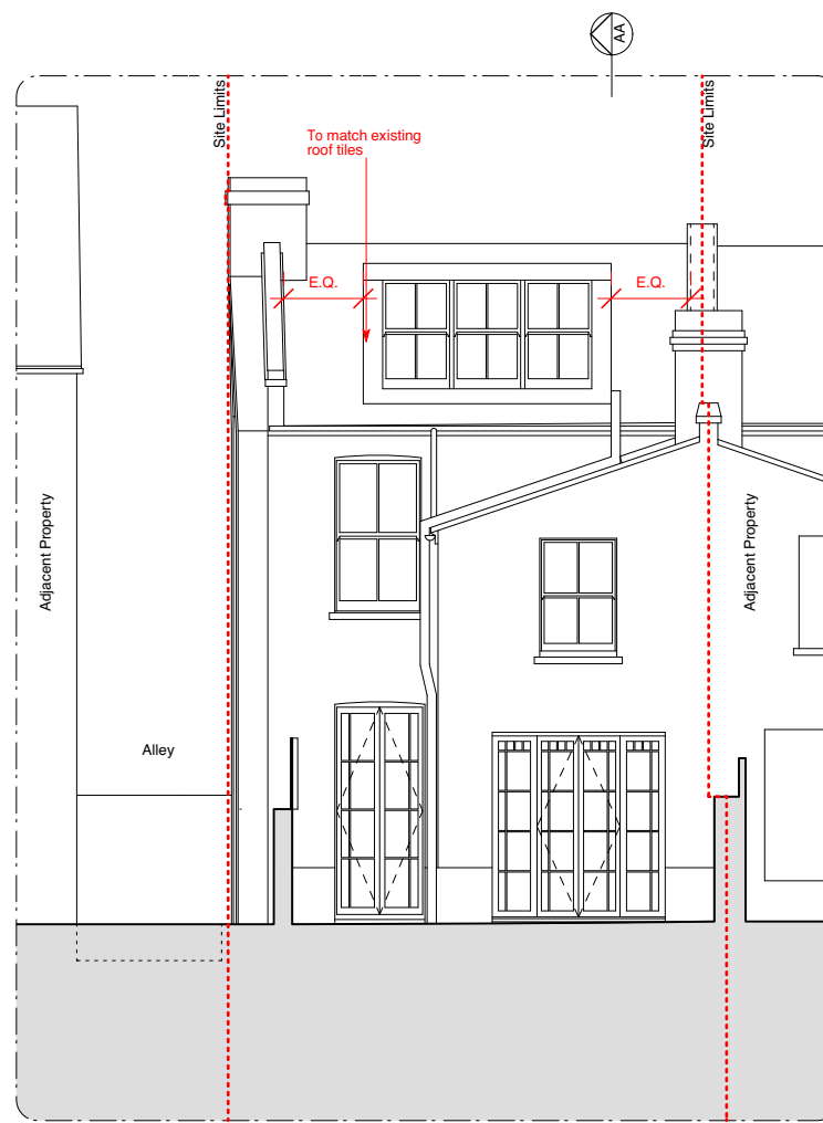
02 Rear Elevation - Section EE