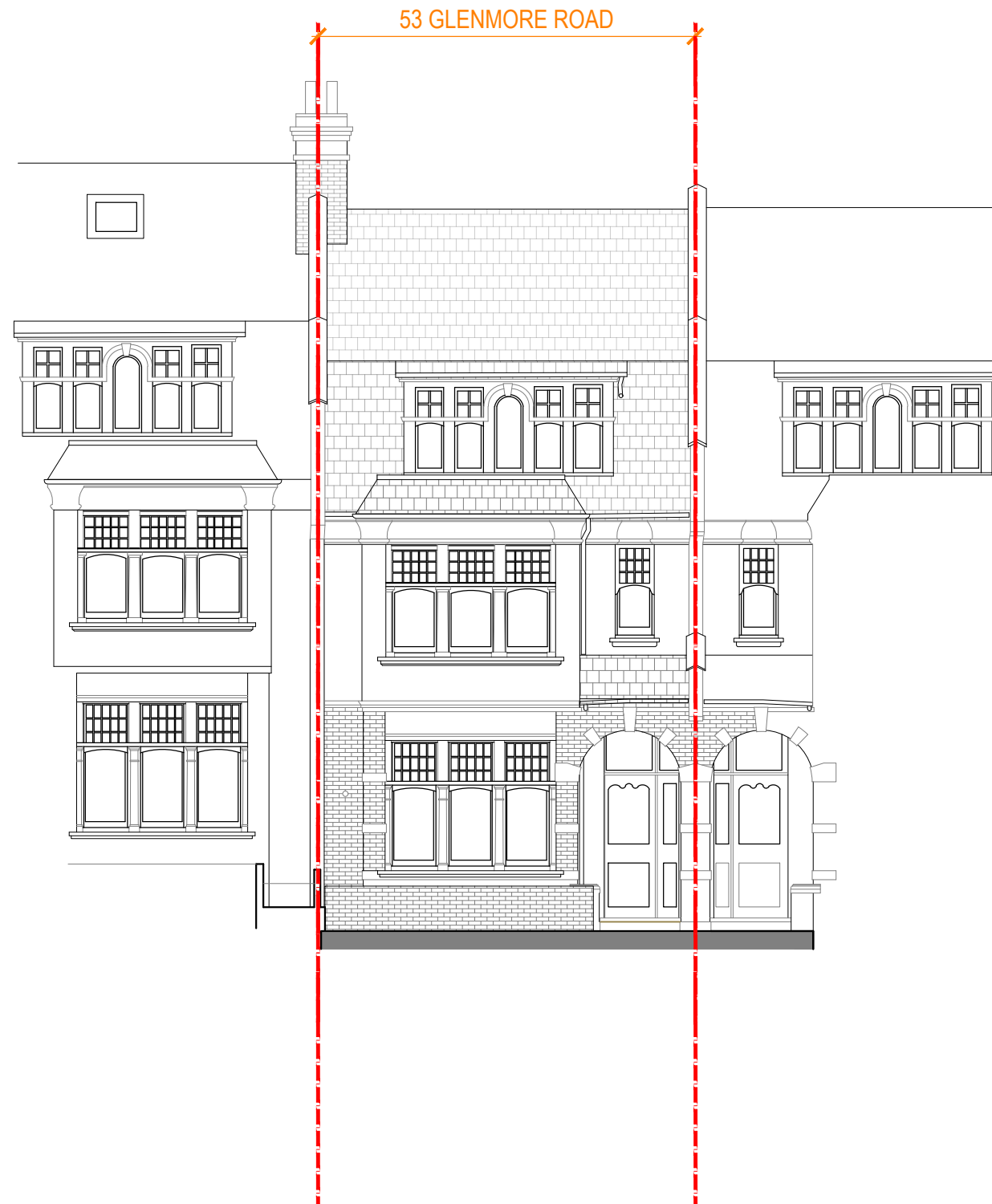
1 FRONT ELEVATION AS EXISTING SCALE: 1:100 @ A3 // 1:50 @ A1