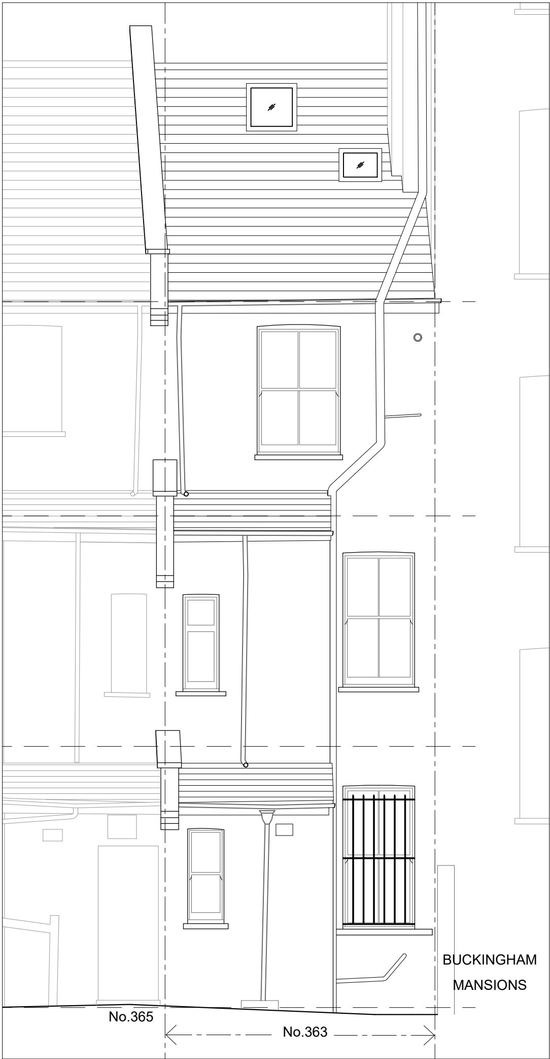
01 205 REAR ELEVATION AS EXISTING 1:50 @ A3