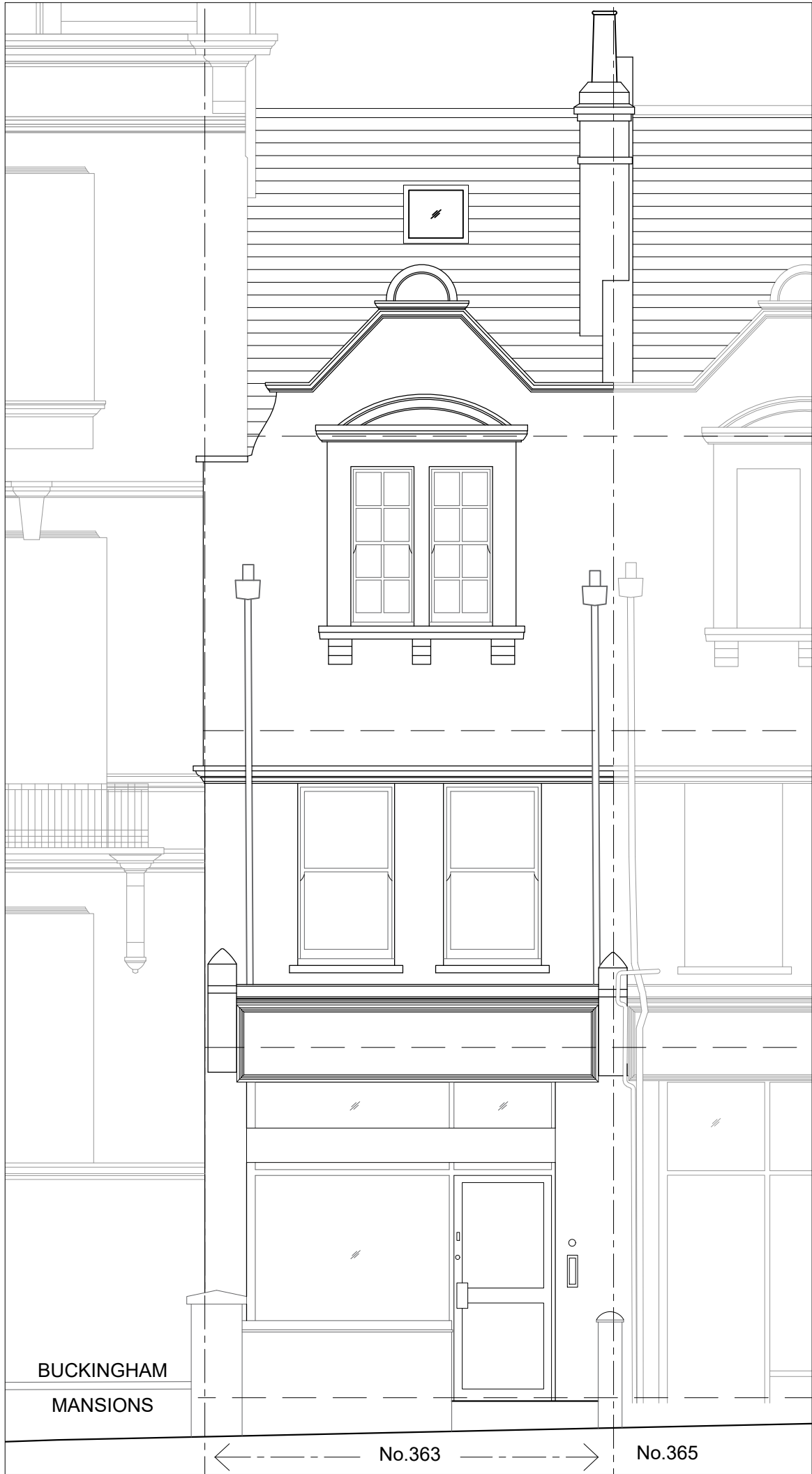
01 FRONT ELEVATION AS EXISTING 204 1:50 @ A3