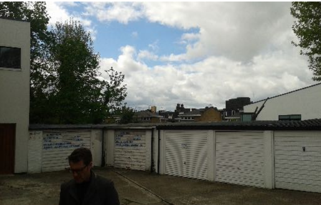
03 Photograph looking West at Garages.