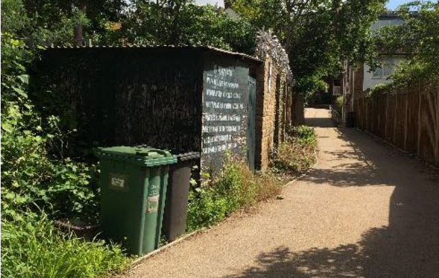
02 Photograph looking East up private drive.