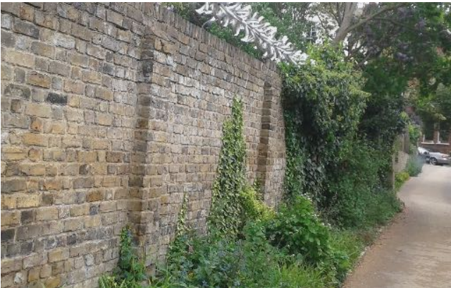
04 Photograph looking East up private drive.

notes: General notes: 1. Do not scale drawings. Dimensions govern. 2. All dimensions are in millimeters unless noted otherwise. 3. All dimensions shall be verified on site before proceeding with the work. 4. Square Feet Architects shall be notified in writing of any discrepancies.