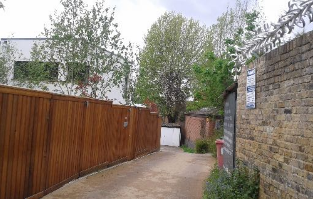
01 Photograph looking West down private drive.