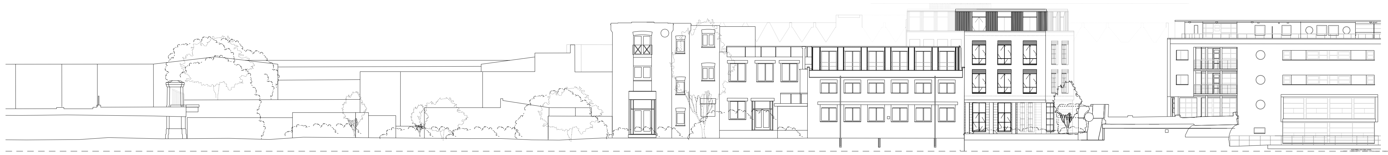
02 PROPOSED ELEVATION 02 REGENT'S CANAL