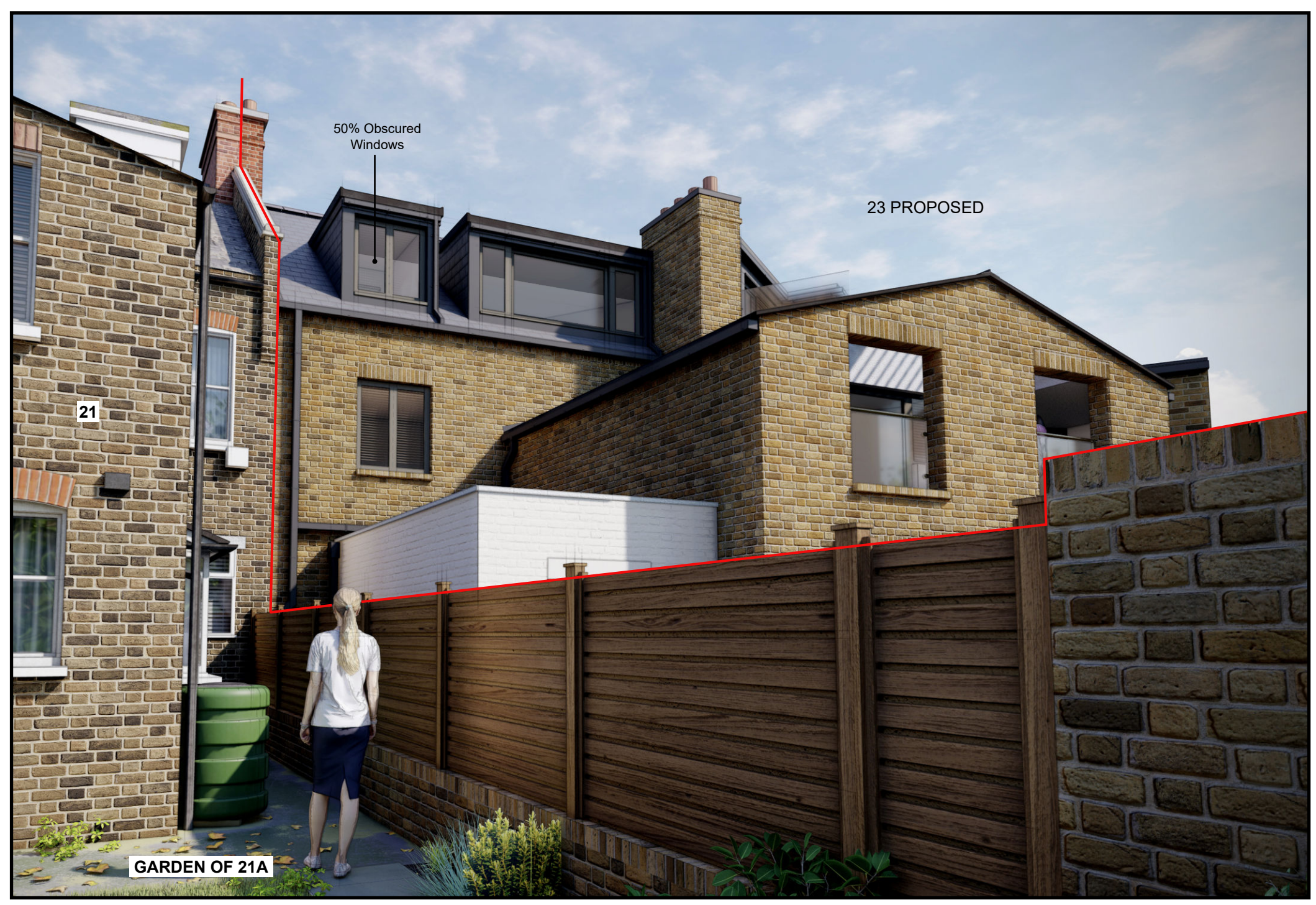
View of the proposed development from the back of No. 21A's garden.