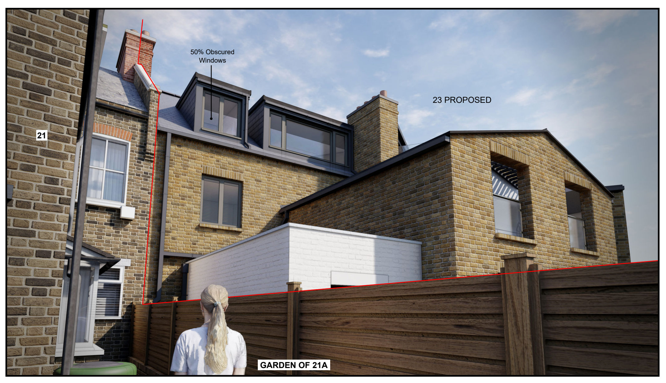
View of the proposed development from the rear garden of No.21A, close to the house.