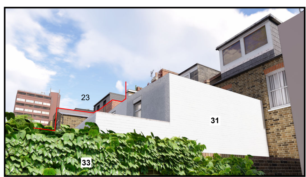
GCI view of the proposed scheme from the garden of No.33.