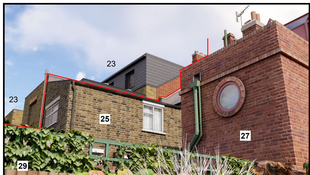
GCI view of the proposed scheme from the garden of No.29.