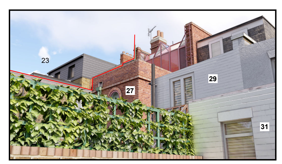
GCI view of the proposed scheme from the garden of No.31.