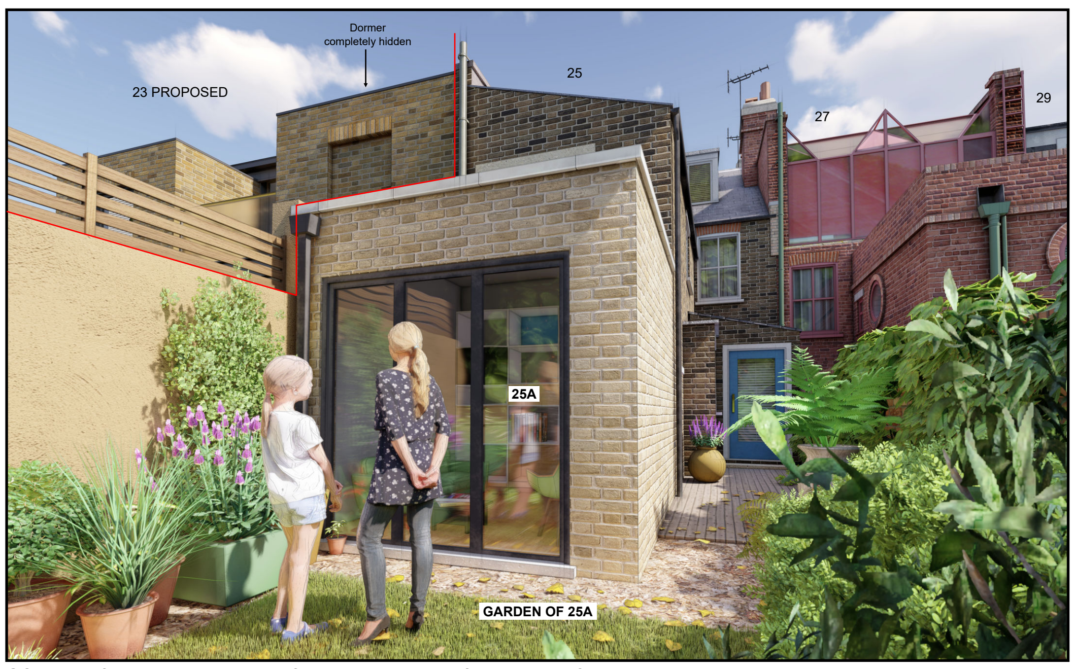
GCI view of the proposed scheme from the very back of the garden of no 25A.