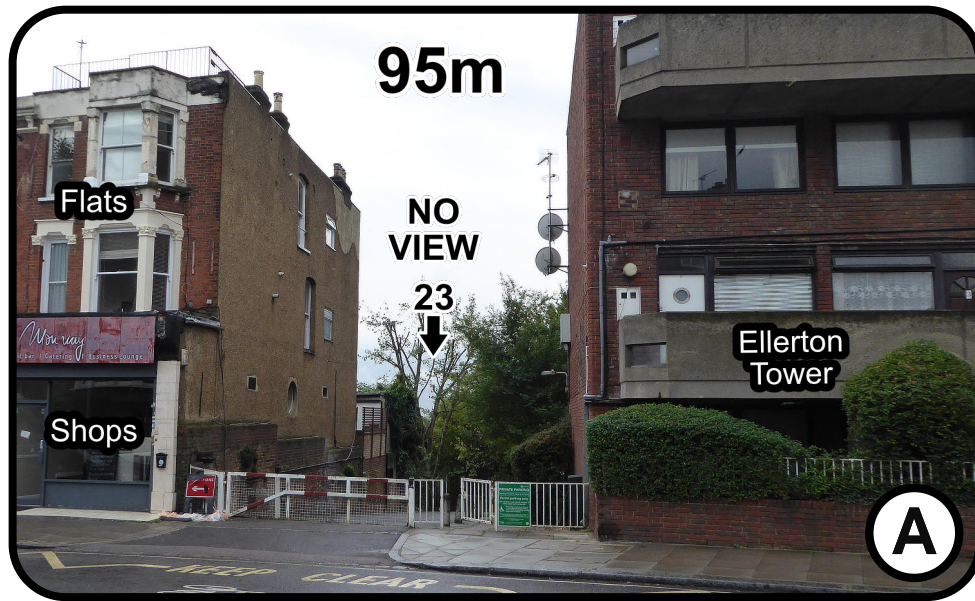
Gap beside Ellerton Tower on Mill Lane.