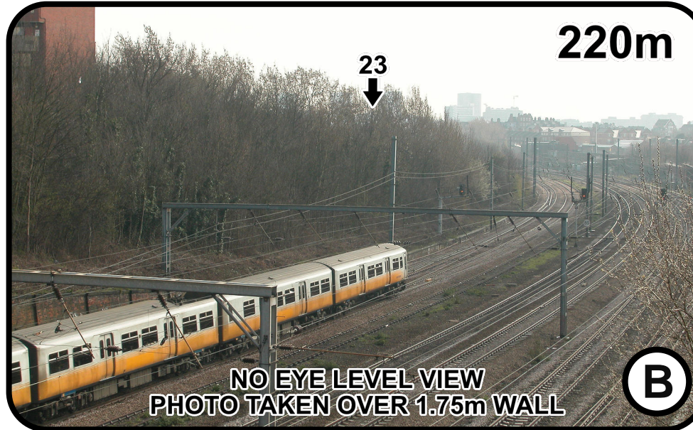
View over the 1.75m Mill Lane Railway Bridge Wall