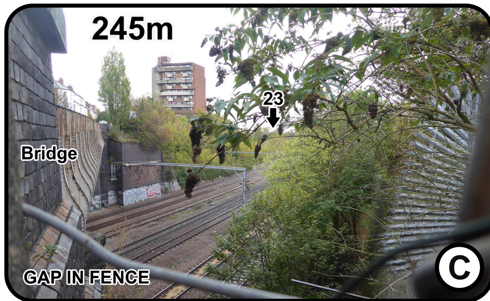
View through a gap in the fence at Mill Lane Bridge