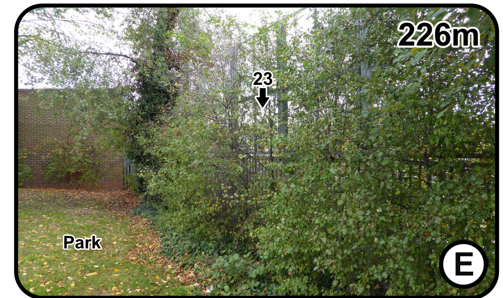
View from Maygrove Peace Park from 226m