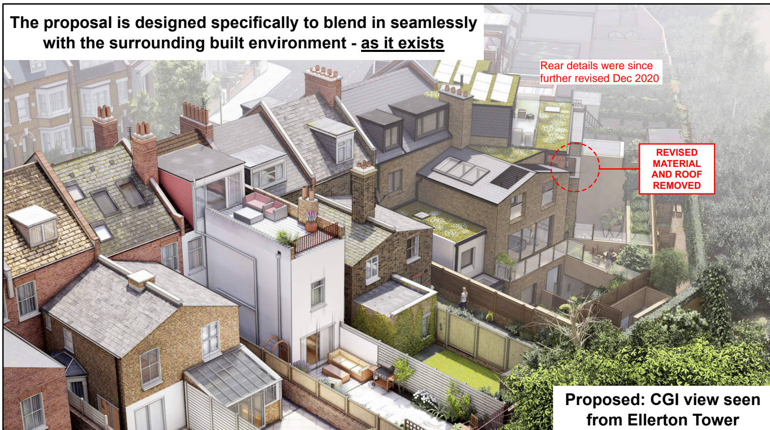
Proposed: CGI view seen from Ellerton Tower

The proposal is designed specifically to blend in seamlessly with the surrounding built environment - as it exists