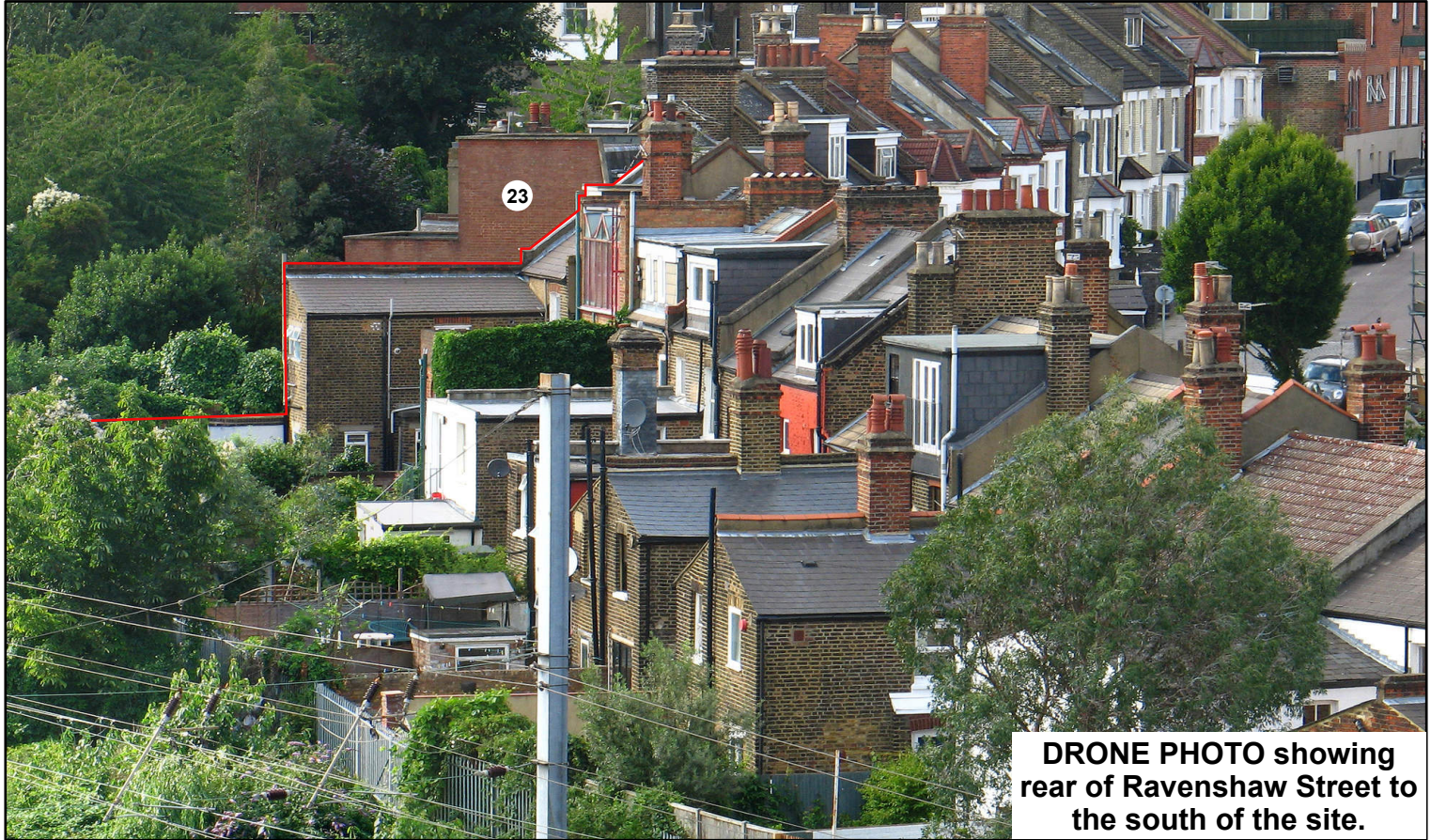
DRONE PHOTO showing rear of Ravenshaw Street to the south of the site.