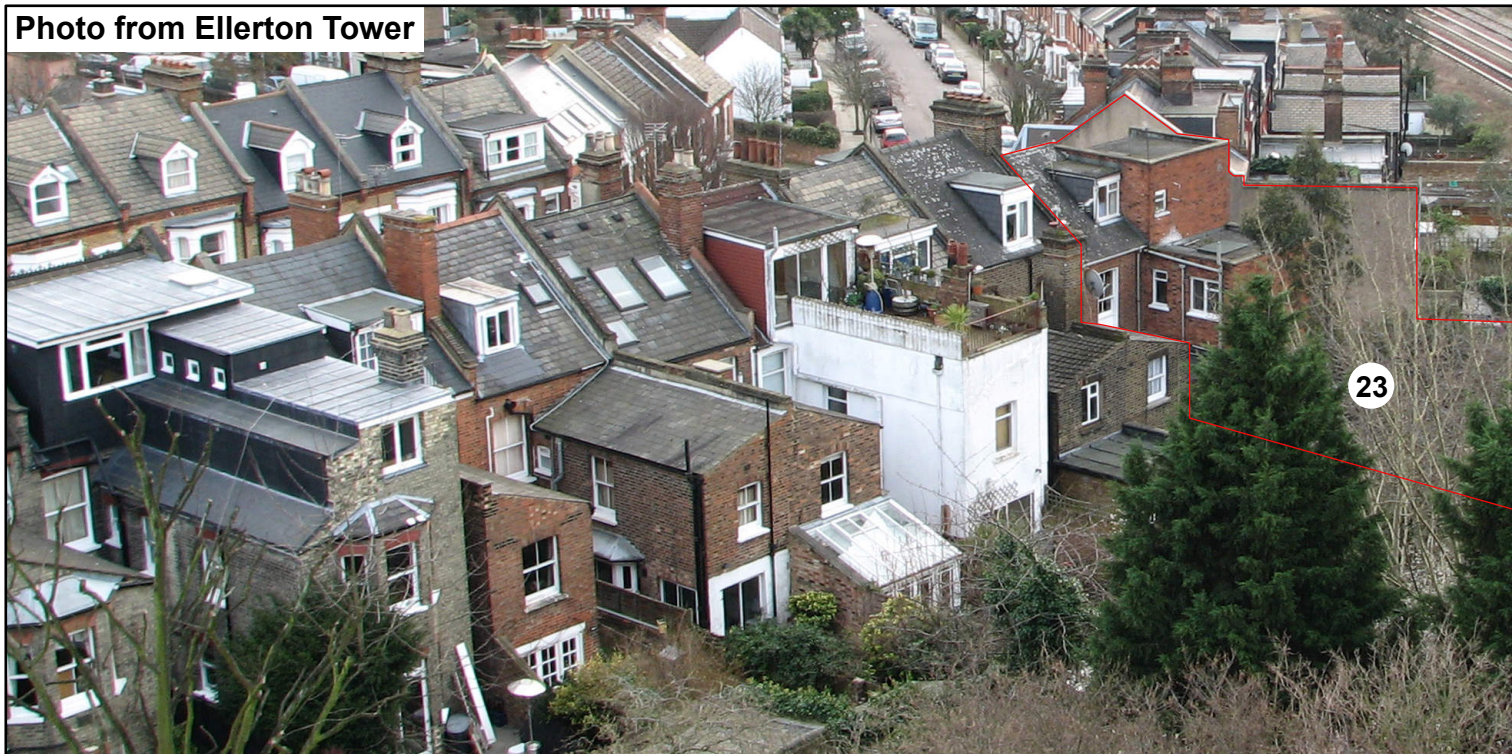
Photo from Ellerton Tower

The extant rear elevations along Ravenshaw Street may very well be dismissed and traduced as a 'Jumble'; but that is it's prevailing characteristic and our proposal works with that.