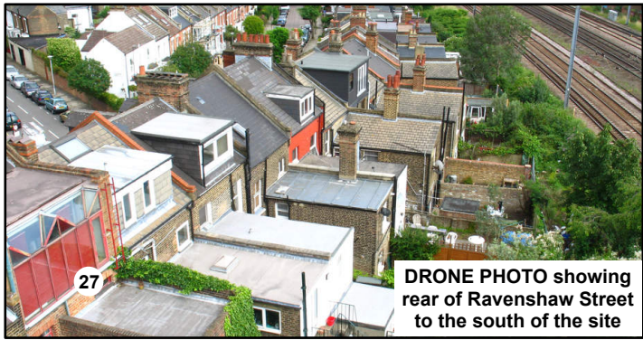
DRONE PHOTO showing rear of Ravenshaw Street to the south of the site