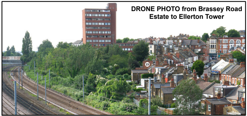
DRONE PHOTO from Brassey Road Estate to Ellerton Tower