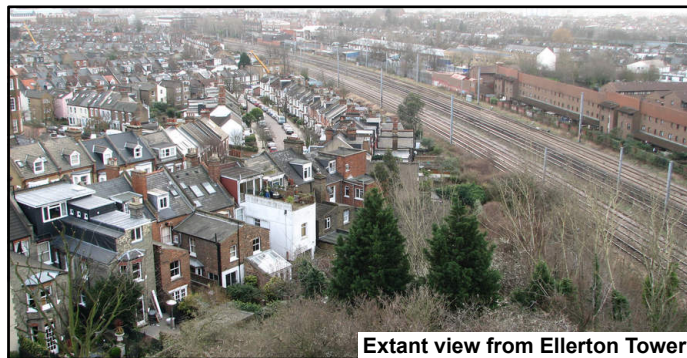
Extant view from Ellerton Tower

The proposed building site does not stand, like many of the LPA's approved applications do, in 'splendid isolation' on a previously undeveloped solitary windfall site. These sites are more usually a garage, abandoned workshop or an assembly of garden ends etc. This application is part infill and part re-development and coupled with the fact that it's in a terrace and backs onto a railway means that it does not fit neatly into the usual pigeon holes. The site's surrounding environment is not neat and tidy. It is most certainly 'a jumble'. The proposal response to is surroundings; this is not a fault of the design.