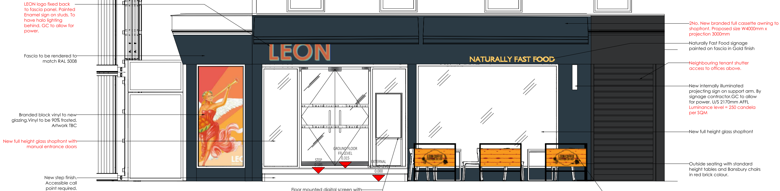
Shopfront elevation - as proposed scale - 1:25 @ A1 / 1:50 @ A3

Written dimensions on these drawings shall take precedence over scaled dimensions. Contractors shall verify and be responsible for all dimensions and conditions on the project and this office must be notified of any variations from the dimensions and conditions shown by these drawings prior to commencement of any work. All contractors are deemed to have made themselves aware of site conditions prior to entering into any contract. Shopfitting details must be submitted to this office for approval before proceeding with fabrication. This drawing is the property of rpa. Copyright is reserved by them and the drawing is issued on condition that it is not copied, reproduced, retained or disclosed to any unauthorised person, either wholly or in part without the consent in writing of rpa.