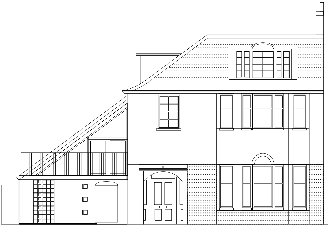
EXISTING FRONT ELEVATION (1:100 @ A1) - NO CHANGE