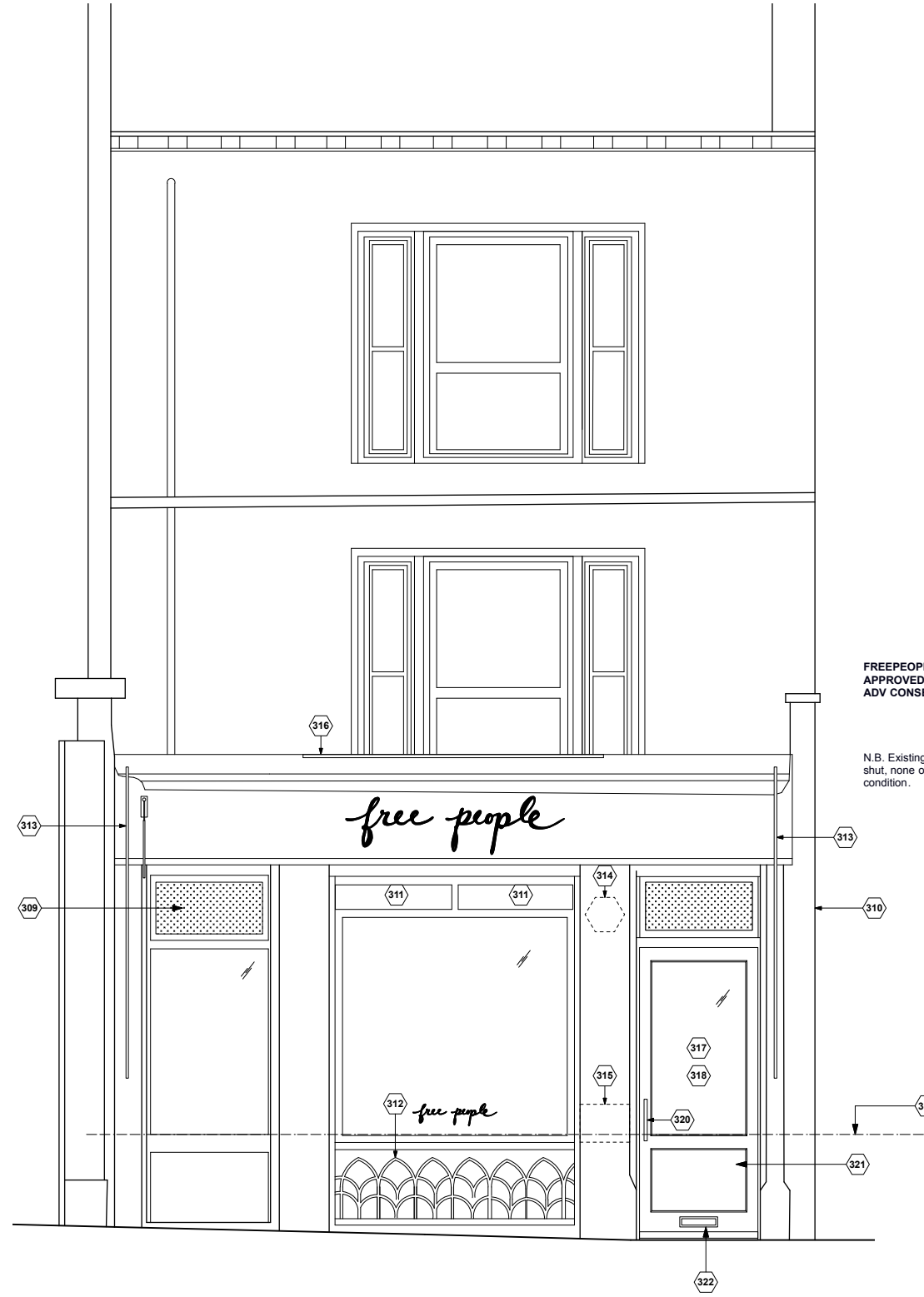
1 PROPOSED STOREFRONT ELEVATION