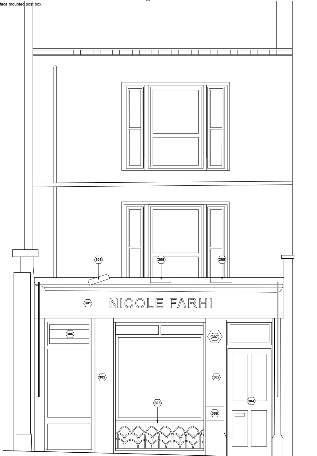
2 EXISTING STOREFRONT ELEVATION

FREEPEOPLE SIGNAGE TO BE APPROVED UNDER SEPARATE ADV CONSENT APPLICATION N.B. Existing canopy to be left fixed shut, none operational and in existing condition.