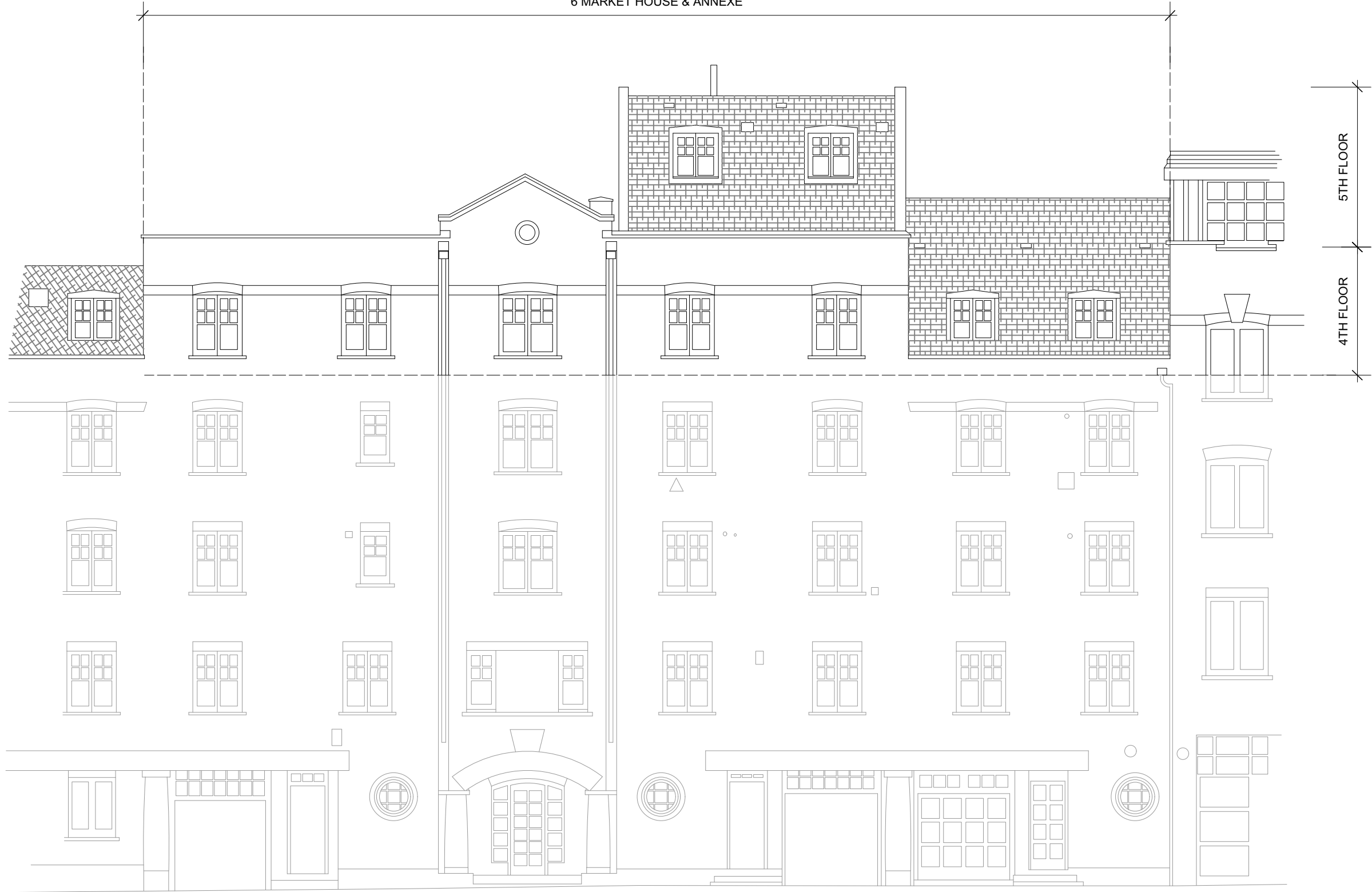
1 EXISTING FRONT ELEVATION SCALE: 1:100

GENERAL NOTES DO NOT SCALE FROM DRAWINGS. ALL DIMENSIONS TO BE CHECKED ON SITE. REPORT OMISSIONS AND DISCREPANCIES TO THE ARCHITECT IMMEDIATELY. REVISION DATES MARKED ON THE DRAWING ARE STATED IN THE FOLLOWING ORDER: YEAR, MONTH, DAY (YY.MM.DD). © MORENO MASEY LTD