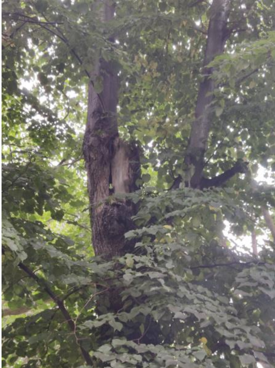
Photograph 1: Decay at pollard point of T9

Web: www.landmarktrees.co.uk e-mail: info@landmarktrees.co.uk Tel: 0207 851 4544