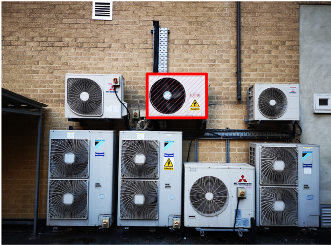
Photo of Air Cooling units to rear of 98 Hatton Gardens