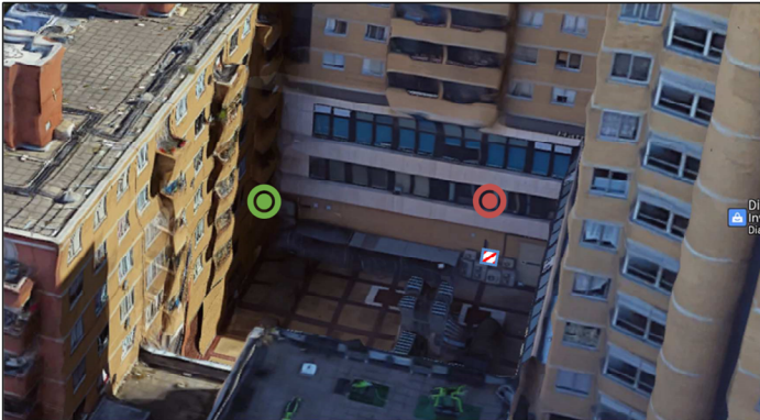
Figure 2.2 Site measurement position, identified receiver and proposed plant unit installation

Extract from Planning Compliance Report (23582.PCR.01) from KP Acoustics showing location of testing equipment and AC unit location to be replaced.