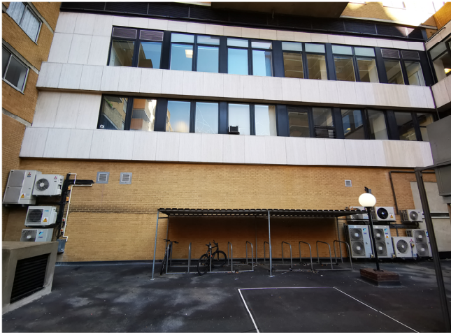
Photo of Air Cooling units in internal courtyard to back of 98 Hatton Garden.