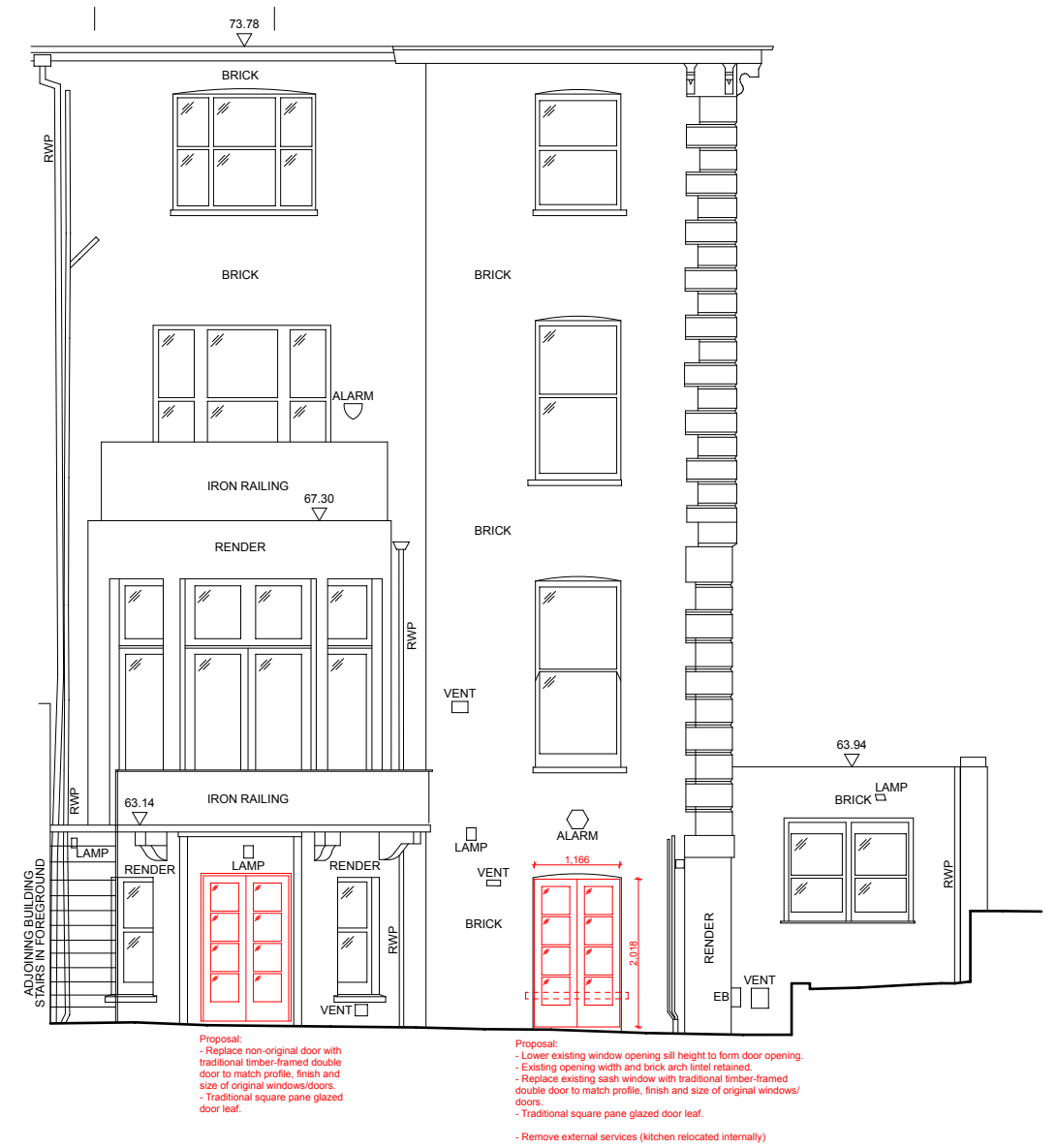
Proposed Rear Elevation_1:100

General Notes: Do not scale from this drawing. All dimensions in metres/millimetres. All dimensions to be checked by the Contractor. Any discrepancies to be notified to the Architect.